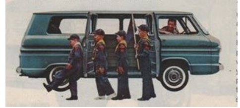
The local Boys Scouts may be helping with the Corvair Museum Dinner. It is expected to be a win/win for them and PCCA.