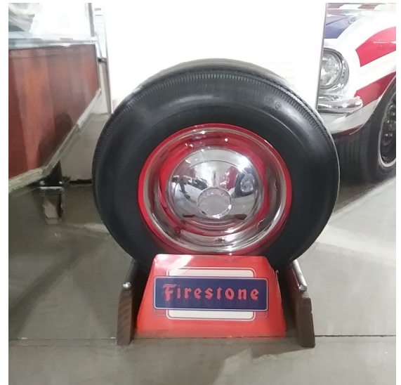
Inside the Corvair Museum, this tire display also describes the research that went into developing a "low" profile tire for the Corvair.