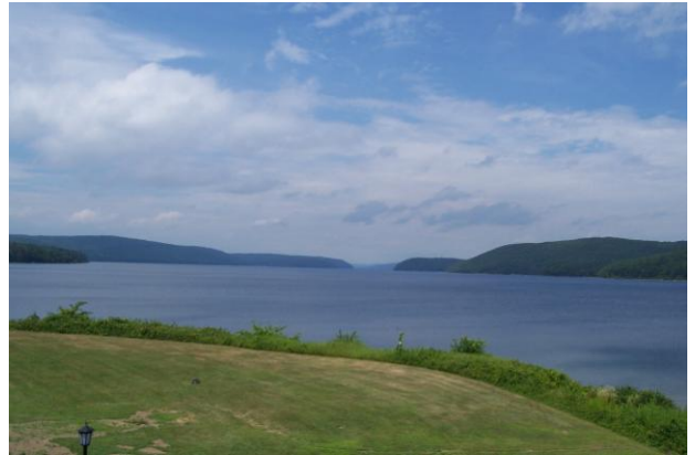
A View of the Reservoir