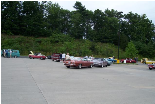
In Line for the Rally