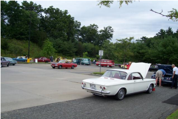
Waiting for the Rally to begin