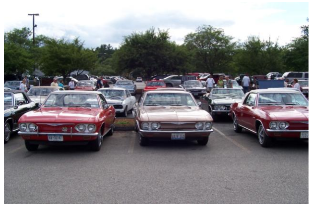
And even more...