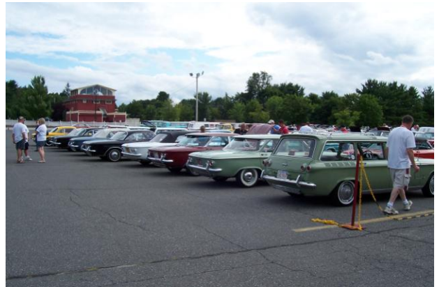
Check out all those Corvairs!!