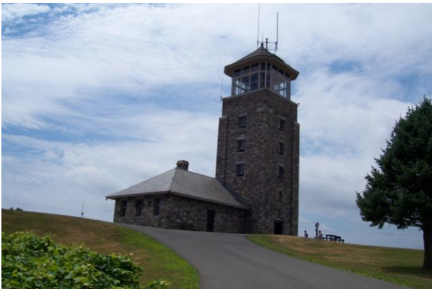
The Stone Observation Tower