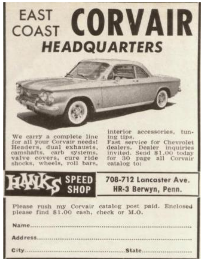
Another Ad from the 60s

Sullivan Fall Auction, Hamilton, Ill, Sept 25-26, 2006 reported in OCW, Oct 26, 2006 1963 Corvair condition 3 $2,100