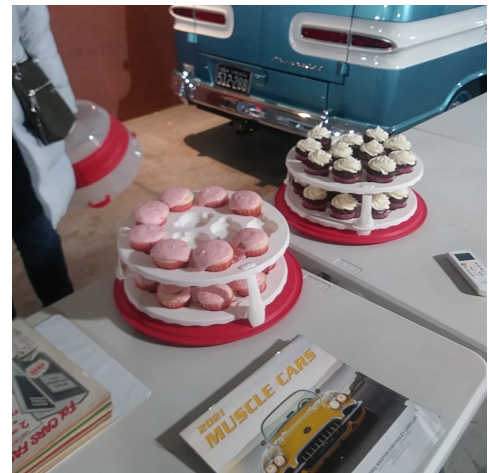
Yummy cupcakes by Carrie.