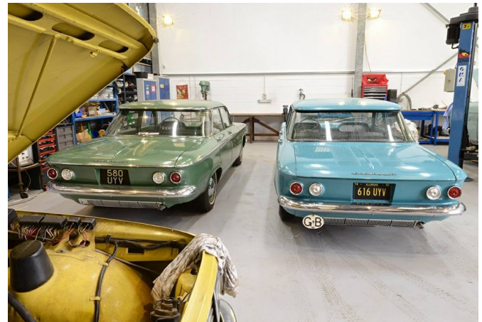
Bob's 60 was the blue one. The green one was featured in a Communique Article just prior to this.