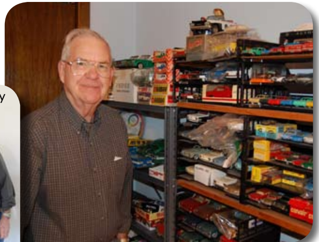
Don's toy room.