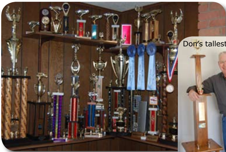
Just of the few of the trophies.