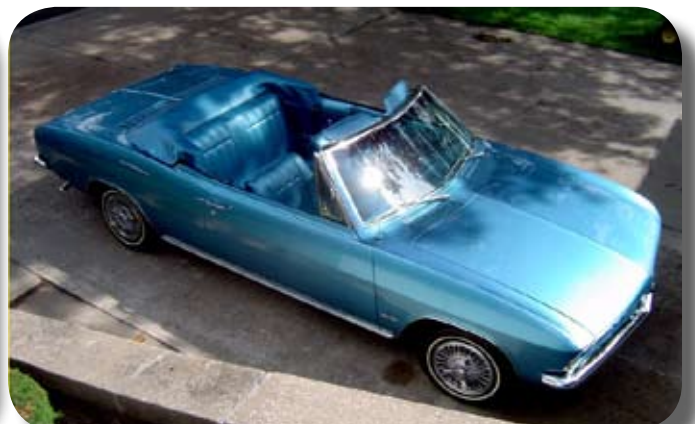
Don's Blue Monza practically perfect in every way!