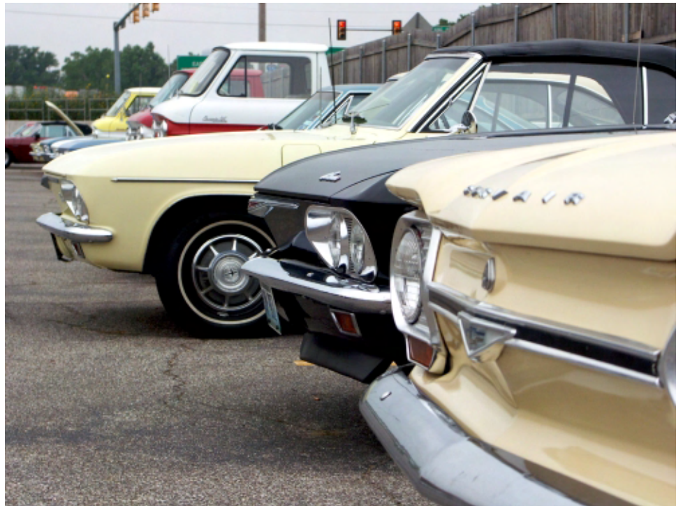
ABOVE: Counting Corvair noses at the Roundup.