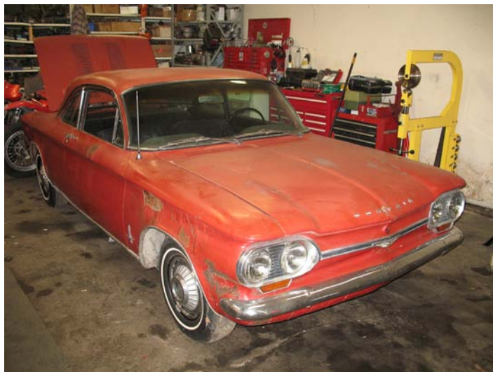
Eric's Corvairs, Red '63 above Gray '64, Below

http://www.Corvair.org/chapters/chapter672/index.html