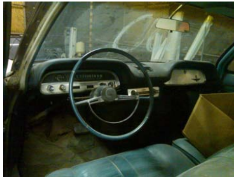
'64 Coupe interior

FOR SALE: 64 Monza 2dr. 110, PG Fresh paint all bumpers and trim are there, just removed for paint. Starts and runs, interior fair. Greg Renfro has seen the car and took these photos. Asking $1500 the owner is Jamie and can be contacted at 316-806-5160