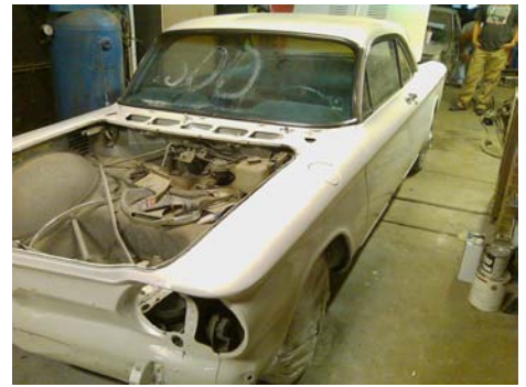
'64 Coupe fresh paint