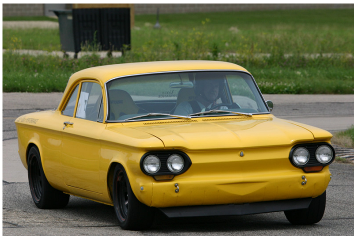
Jim charges around the last corner before the finish line. It was a great day for racing Corvairs.