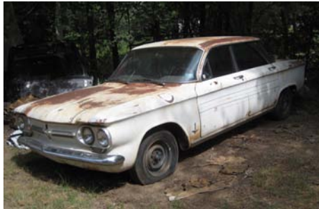
'62 Sedan exterior

FOR SALE: 62 Monza 4dr. PowerGlide. White with red interior. Complete car not running, some rust, interior will need work. The car is located at Jerry Bergman's in Haysville. Contact Lester at 316-644-1850