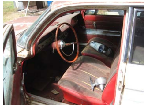
'62 Sedan interior

FOR SALE: 62 Monza 4dr. PowerGlide. White with red interior. Complete car not running, some rust, interior will need work. The car is located at Jerry Bergman's in Haysville. Contact Lester at 316-644-1850