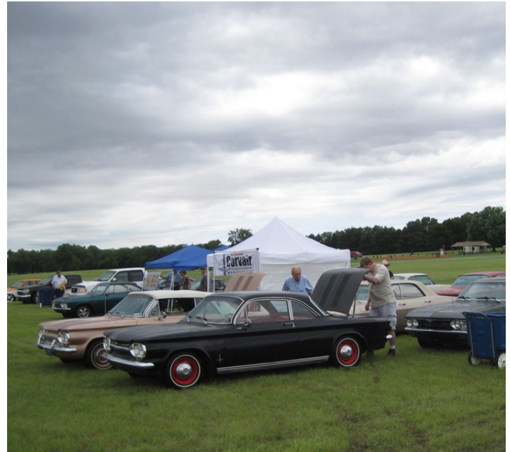
Dark clouds and rain threatened the Lake Afton Car Show. The organizers called it on after 9:30 and after a few more showers the sun broke thru and it turned into a great day to celebrate Cor-