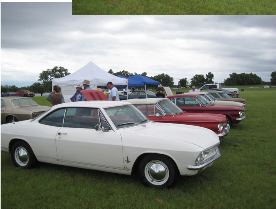
LEFT: The same row of Corvairs, just from the other direction. The Early Model Corvair owners whipped the Late Model Corvair owners by getting 7 EM Corvairs to the meeting vs. only 5 for the LM guys.