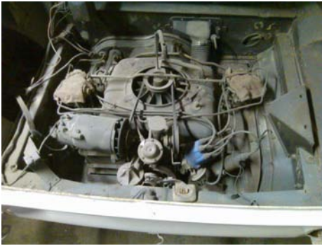
'64 Coupe engine compartment

FOR SALE: 64 Monza 2dr. 110, PG Fresh paint all bumpers and trim are there, just removed for paint. Starts and runs, interior fair. Greg Renfro has seen the car and took these photos. Asking $1500 the owner is Jamie and can be contacted at 316-806-5160