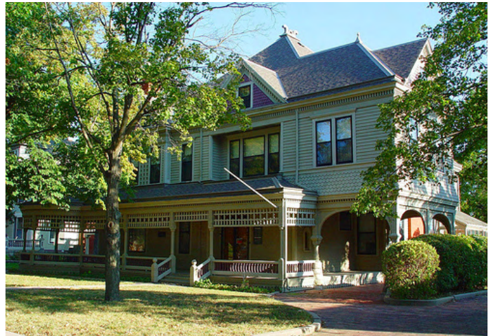
VCCA and MCCA are planning a road trip to the historic Warkentin House in Newton October 23.

The Warkentin House, was built between 1886 and 1887 and is listed on the Kansas and National Register of Historic Places it is a splendid example of the Victorian period in American architecture. More details will be presented at the November meeting.