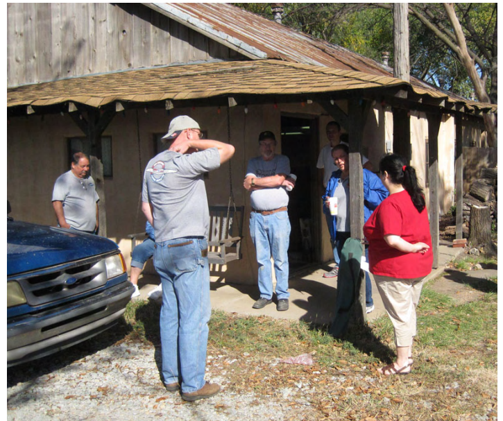
ABOVE RIGHT: Gathering outside to chat was one of the most popular activities at Luna Tuna.