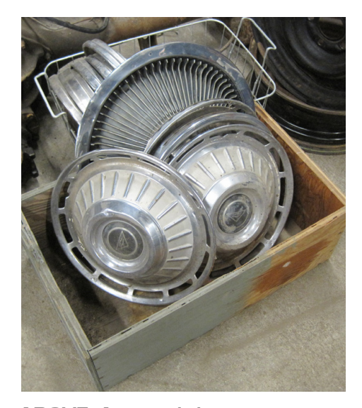
ABOVE: As usual there were Corvair wheel covers to be found at the Wichita A's swap meet. These were unusual being full sized caps for EM 500s & 700s.