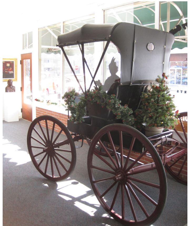
TOP LEFT: Old photos of vintage gas stations and race cars from Newton were exhibited at the Harvey County historical society building basement. ABOVE: The Carriage Factory Gallery once manufactured horse-drawn carriages like this one displayed in their lobby. Now it is a gallery displaying two and three dimensional art from the region.

Just a walk of a couple of blocks down the street was an outstanding lunch at the Breadbasket. It was busy and crowded, but provided a tasty meal.