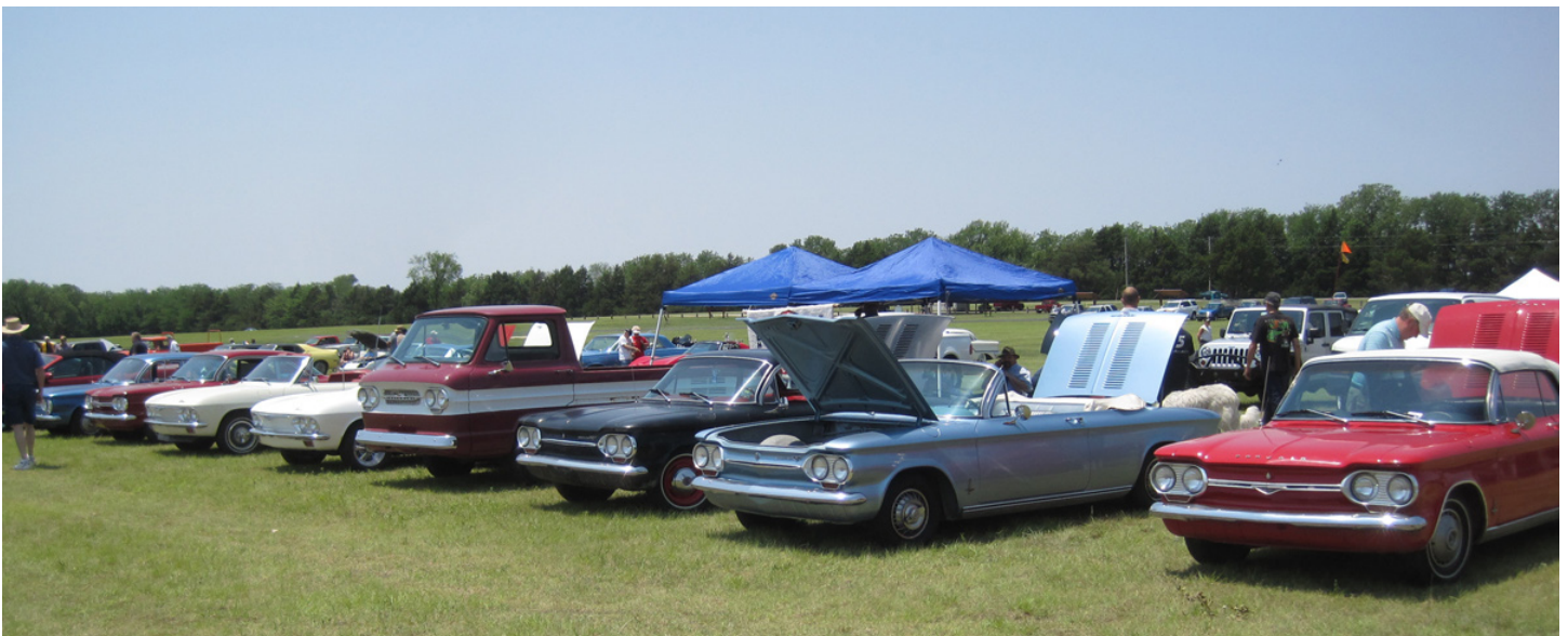
BELOW: Another view of the clutter of Corvairs. A wide variety of Corvairs were represented, sedans, coupes, convertibles, and trucks as Early Model (a lot) and Late Model (fewer).