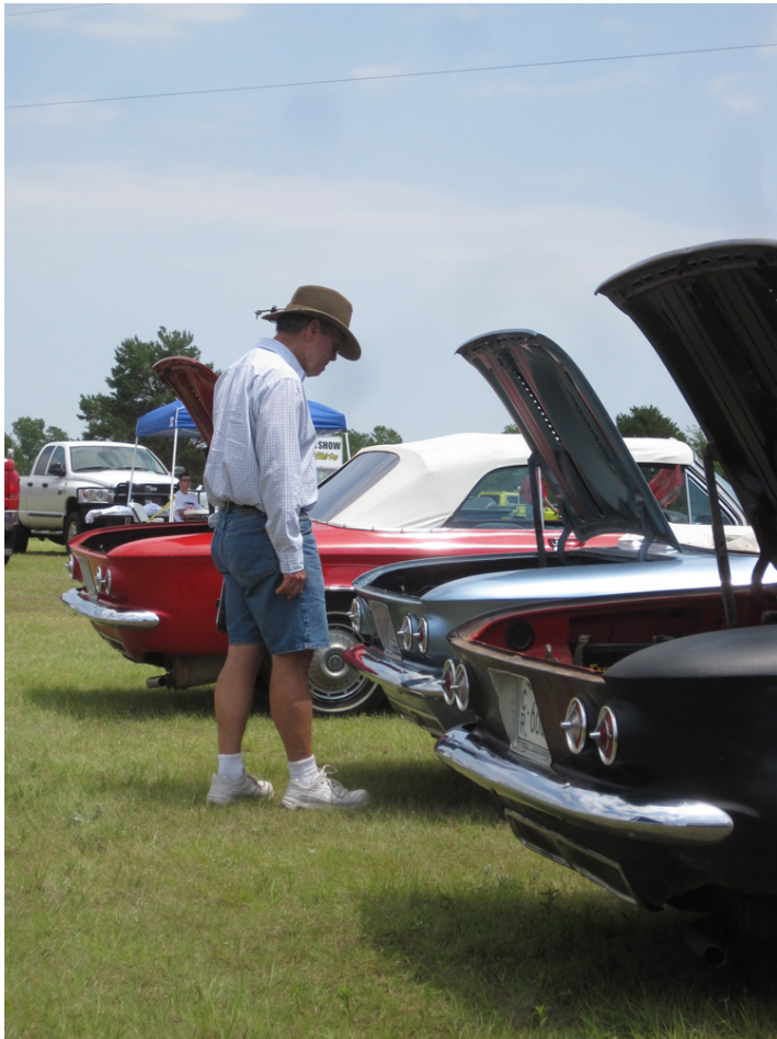
ABOVE: Many spectators checked out the Corvairs lined up at the Lake Afton All Wheels Car show. Corvair comments and questions abounded.

Again this year dark clouds and threats of rain early Sunday morning hurt attendance at the annual Lake Afton All Wheels Car Show, one of the largest free outdoor cars shows in the nation. Those that did show up were greeted with sunshine and pleasant weather. In addition to the Show the MCCA also holds it's June meeting.