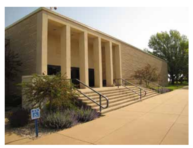
Eisenhower Museum in Abilene, KS.