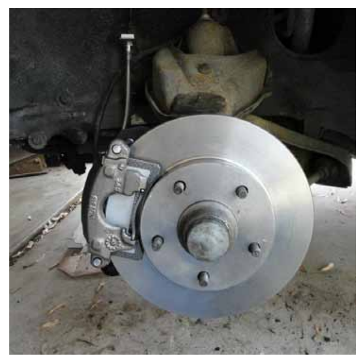
Ned's latest project on his LM white Monza coupe was a disc brake conversion for the front. The caliper brackets were picked up in Indy and the rest of the parts locally.