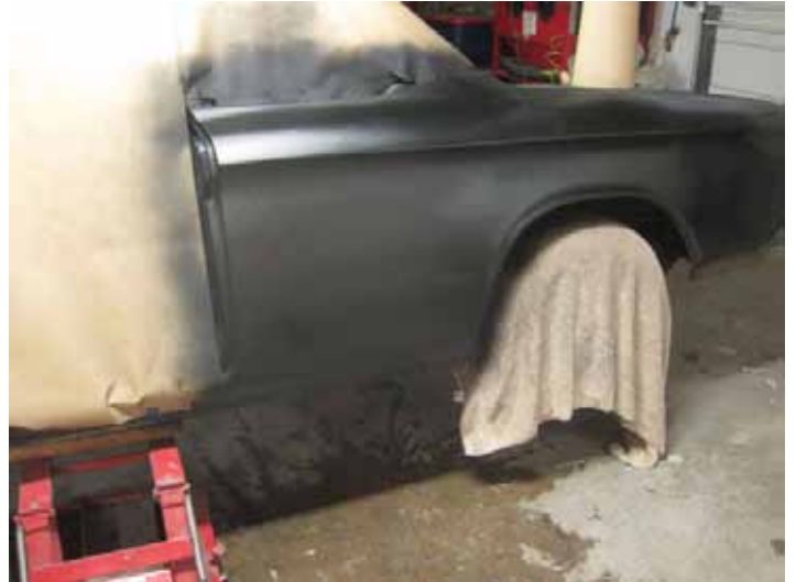
Several skim coats of body filler and the quarter was ready for some John Deer Blitz Black paint.