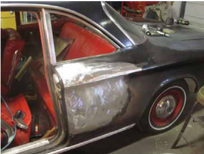
Next was some hammer and dolly work, a session with the welded stud dent puller and some grinding . . .