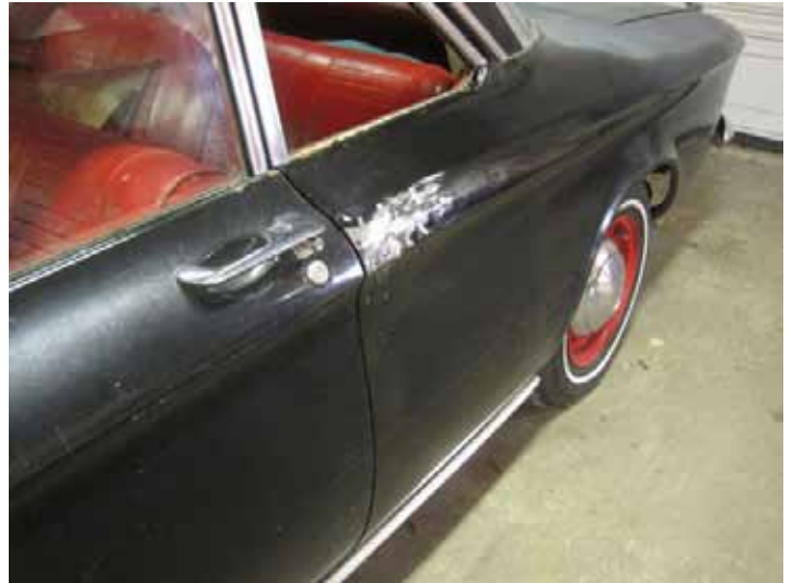
After a session with the Port-a-power the major part of the dent is gone and only a few wrinkles are left.