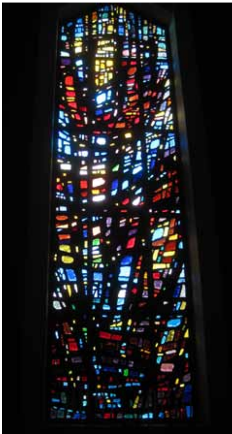
ABOVE: The light filtering thru the stained glass windows of the Eisenhower Chapel.

After a group photo and a stop at Sonic for refreshments the Corvairs and other cars headed North for the trip back to Wichita.