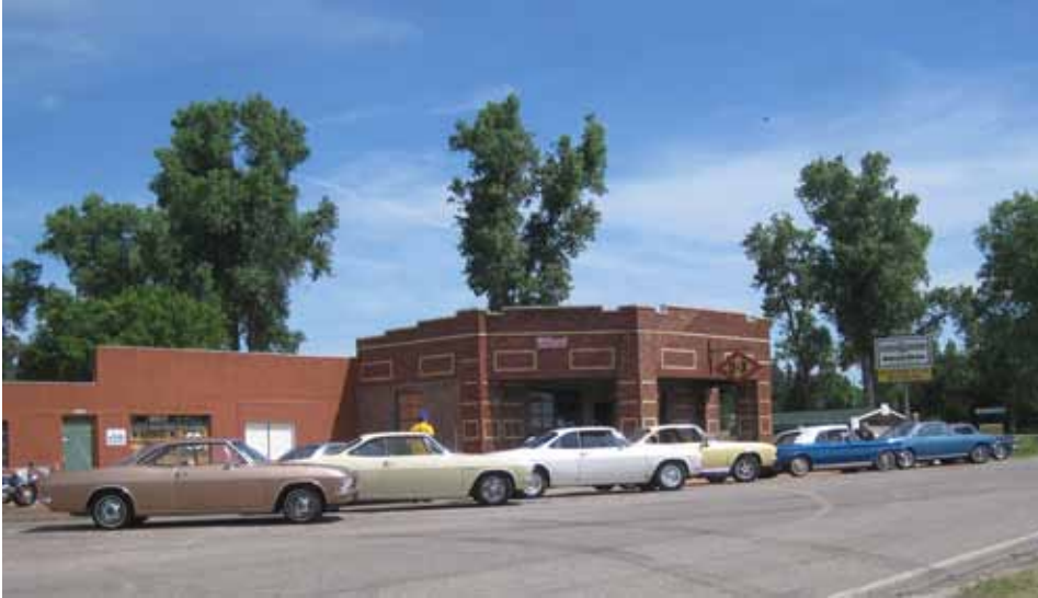
ABOVE: The OKC & ITC Corvairs line up in front of the Seba Station Museum. LEFT: Ned's & Terry's Corvairs parked at POP's.