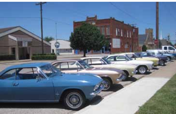
Some of the 11 Corvairs that showed up in Stroud, OK for lunch at the Route 66 icon, the Rock Cafe.