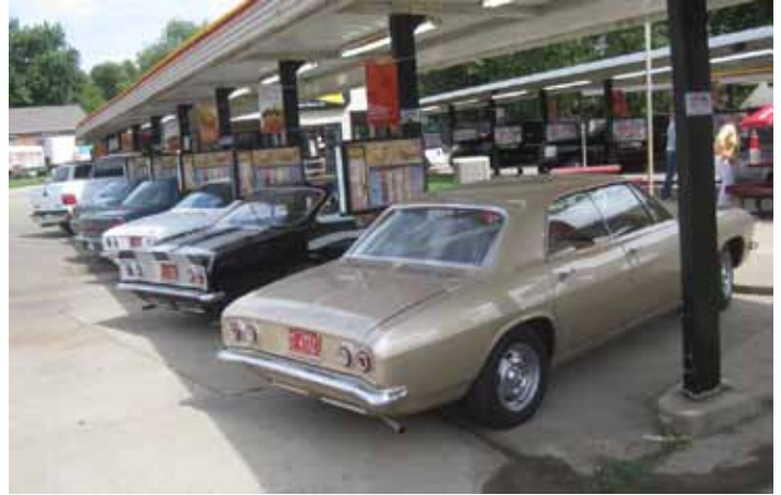
Before heading home the MCCA members pulled up in the Abilene Sonic for ice cream and drinks.

Next it was on to the main museum. The first display was a new Elvis exhibit from the Smithsonian consisting of large photographs