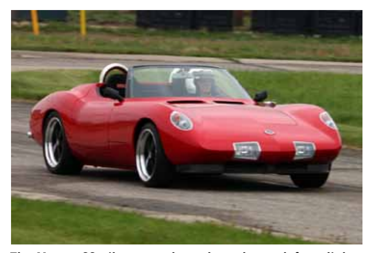
The Monza SS tribute was brought to the track for a little more spirited testing than could take place on the streets.

on the drive up there was cold and windy and it rained after we got to Marshalltown. The weather on the day of the event was very winter like. The temperature