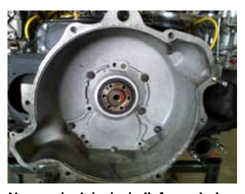
No wonder it leaked oil, four missing bolts. The ones that were there were loose, plus a missing gasket.

It was Wednesday noon and the engine had to come out and the trans-axle had to come off. When I quit to get ready to teach on Wednesday night it was almost ready to come out. Thursday morning after everything was apart several problems became apparent. Four bolts between the bell housing and block were missing and the others were loose. There was no gasket at all between the bell housing and block, surprised it