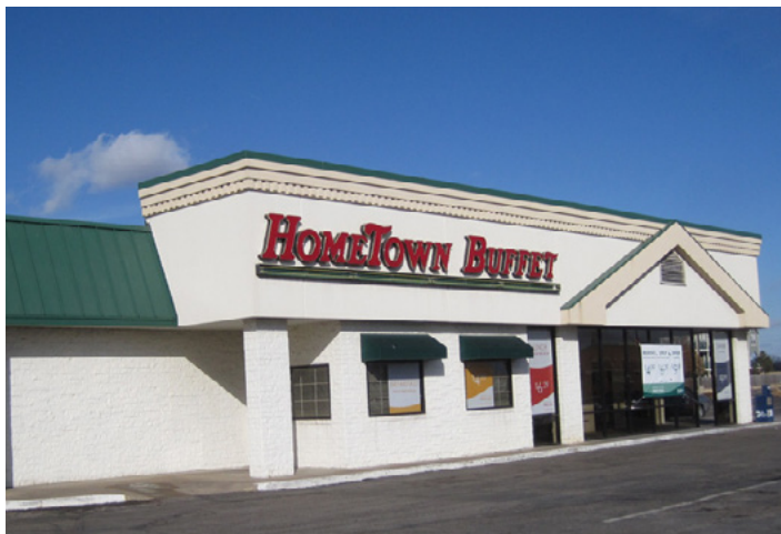
The HomeTown Buffet 6820 W. Central is the site for Saturday night's MCCA Pre-Spring Social. There will be a special seating area for Club members.