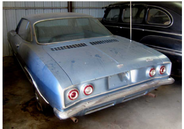
The body of the coupe is not too bad. Suffers from a bad repaint and some rust in the rear window.