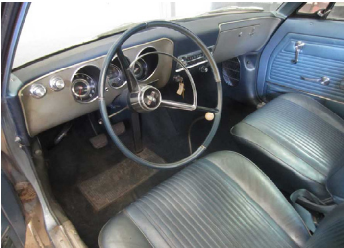
Interior of the '65 coupe. Seats discolored from the sun the top of the rear seat is split.