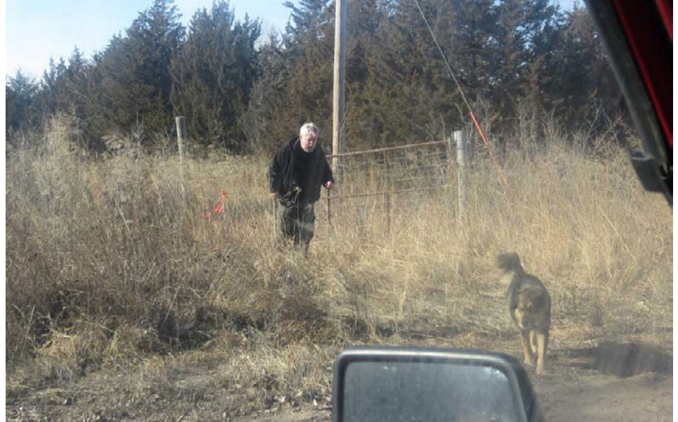
UPPER LEFT: The engine of the red convertible stripped of the AC. LOWER LEFT: Lacquer paint is still nice on the red convertible. ABOVE: The overgrown entry road to the home of the blue coupe. BELOW LEFT: The stuck 140 in the blue Monza coupe.

stripped from the engine compartment but were available. The red Corvair hadn't been started for a couple of years, but the engine was free. At $6,000 it wasn't a toad or frog, but not a prince either.