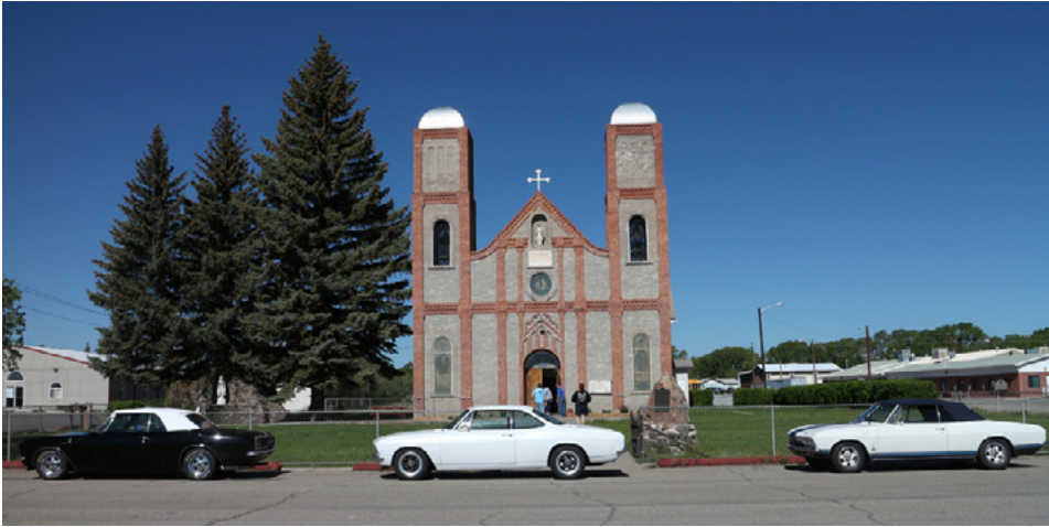
LEFT: One stop on the way home was the oldest Catholic church in Colorado, built in the 1800s and updated several times. MIDDLE: Jan and Tami Mohr had the winning ticket for the raffle quilt complete with Corvairs of all years and colors. BOTTOM: Riders on the Storm. The dark clouds were an indicator of the upcoming weather. Rain haunted the last three hour of the drive home, often heavy enough that you could barely see.

Continued from Page 4 up to about 9800 feet). The 95/PG did struggle a bit going up, but going down, I was happy I had disc brakes.