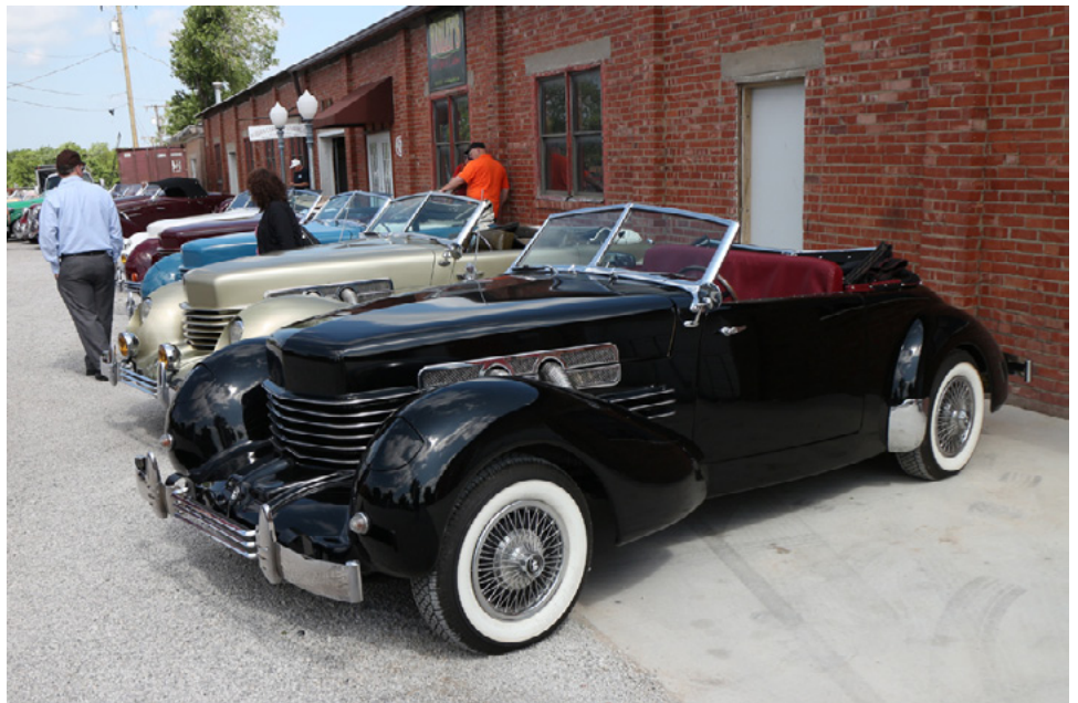
Terry Kalp and Ned Madsen headed out to Broken Arrow, OK on May 8 for the 50th anniversary celebration of the Corvair powered Glen Pray Cord Sportsman. Five examples showed up at the "pickle factory" in Broken Arrow where the prototypes were constructed.

plus Braden met up at the Car-rage Crossing in Yoder for a hearty breakfast before continuing on to Hutchinson. Once at the Cosmosphere they were able to enjoy the museum, movies and Dr. Goddard's laboratory.