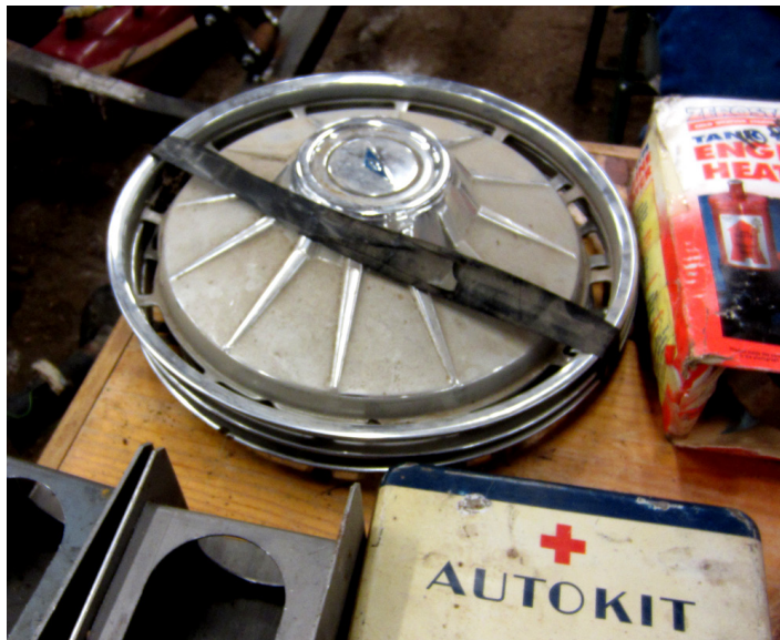
You can always find Corvair hubcaps at the Wichita Swap meet. These are for '61 500 or 700 Corvair.