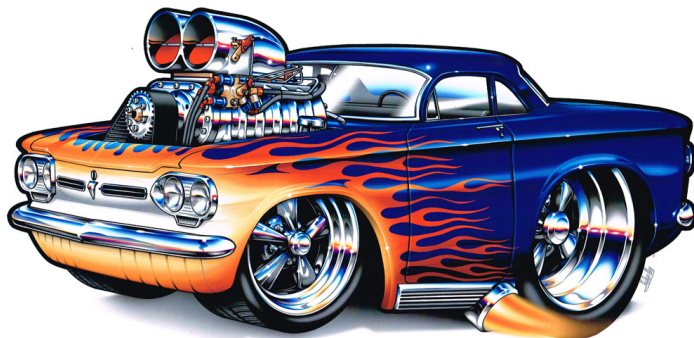
A couple of MCCA members purchased this 11 x 17 inch illustration of a Muscle Machine '62 Corvair.