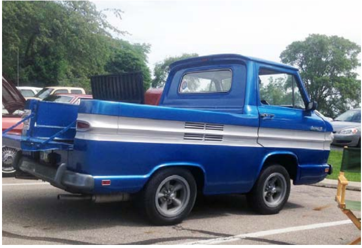
TOP: The Ohio Valve cover track was set up for total distance, which made the track itself more compact. BOTTOM: This shortened Rampside was renamed Crampside and was one of the hits of the show.