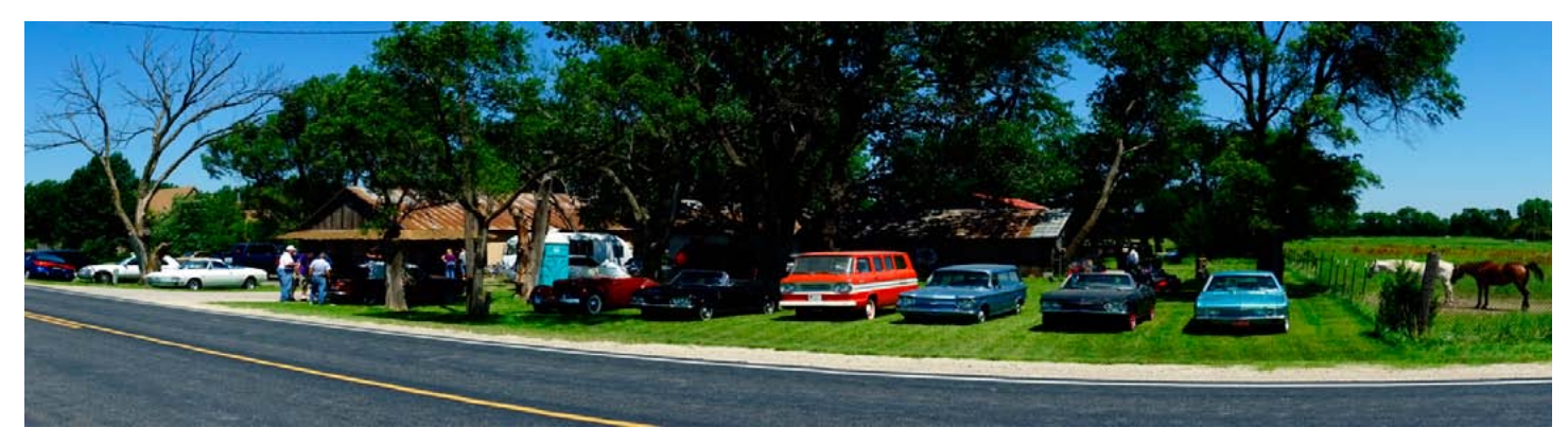
A panoramic photo shows the variety of Corvairs and Corvair powered vehicles that came out for the Tuna.