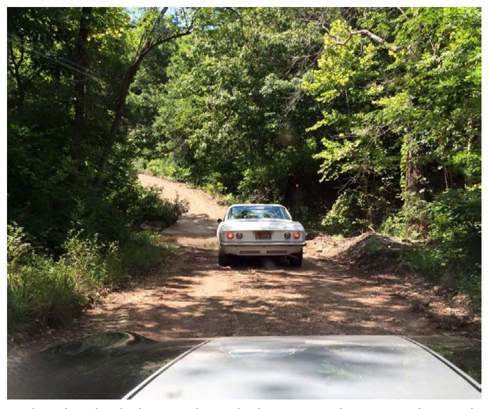
Ned Madsen leads the tour down the last unpaved quarter-mile stretch to the Cowley Falls. The group traveled mostly two-lane blacktop with a particularly twisty section of Highway 14 out of Dexter.