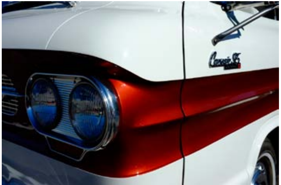
This white Rampside with a brilliant Copper stripe took best FC and Peoples' Choice at Tri-State in Durango. See story on pgs. 4 & 5.