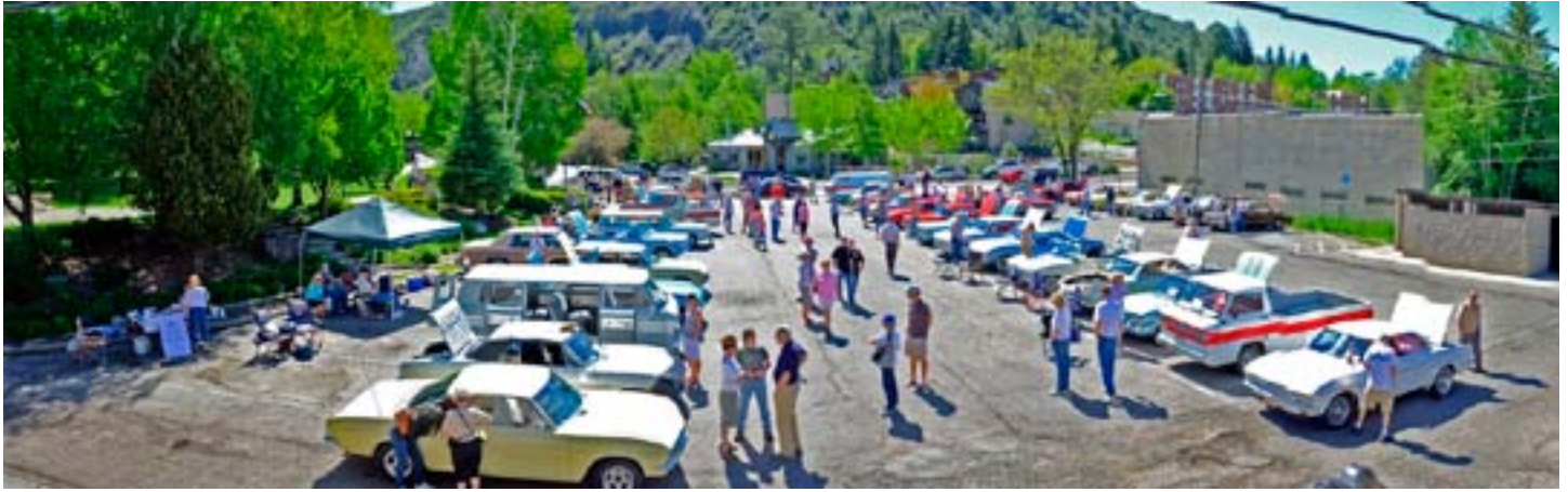
A panoramic photo of the Saturday morning car show in the parking lot for Rotary Park downtown.