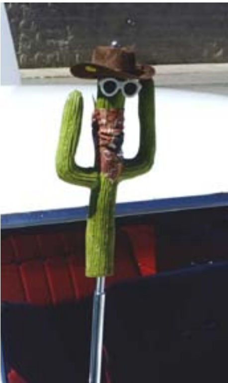
TOP: A nice survivor '62 700 series station wagon at the show. The original (but very baked) black paint contrasted nicely with the red interior. BOTTOM: Larry Yoffee from Corvairs of New Mexico showed this excellent 1965 Corsa powered by the optional 180 hp Turbocharged engine. LEFT: This cactus antenna topper on a white LM coupe was a reminder that we were getting close to the great SouthWest.