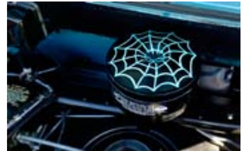
ABOVE: This fairly rare EM oil bath pre-cleaner was decorated with a pinstripe spider web.