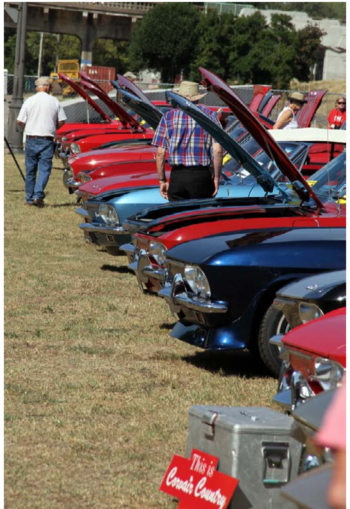
ABOVE: Late Model Corvairs lined the other side of the park during the the 2015 Roundup Car Show.

At about the half way point, there was a place to take a break, get a drink and perform some games. The first was a fan belt toss, second was a bean bag toss and finally a dice roll. All three contributed to the score. Additionally, there were questions and fill in the blanks things like: what kind of school is on