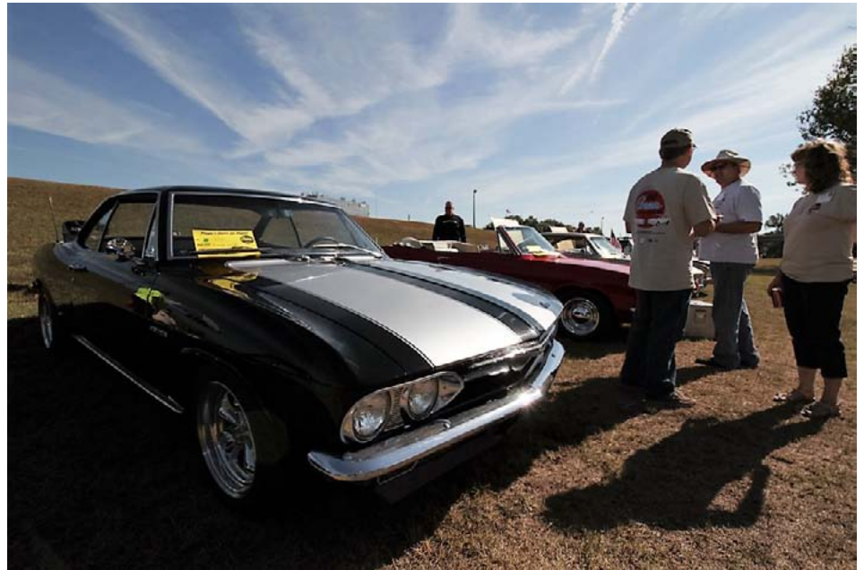
Ned Madsen chats with Mark and Darlene Welty in front of the Welty's' black and silver Corsa. The weather in North Little Rock, AR was perfect for the 2015 Great Plains Corvair Roundup. See story on page 4.

Dates for October activities were set: Central & West - Oct 16, Luna Tuna - Oct 17, MCCA Road trip Woolaroc Museum and Wildlife Preserve - Sat, Oct 24. 8 am departure from the old Dillon's at Madison & Rock in Derby.