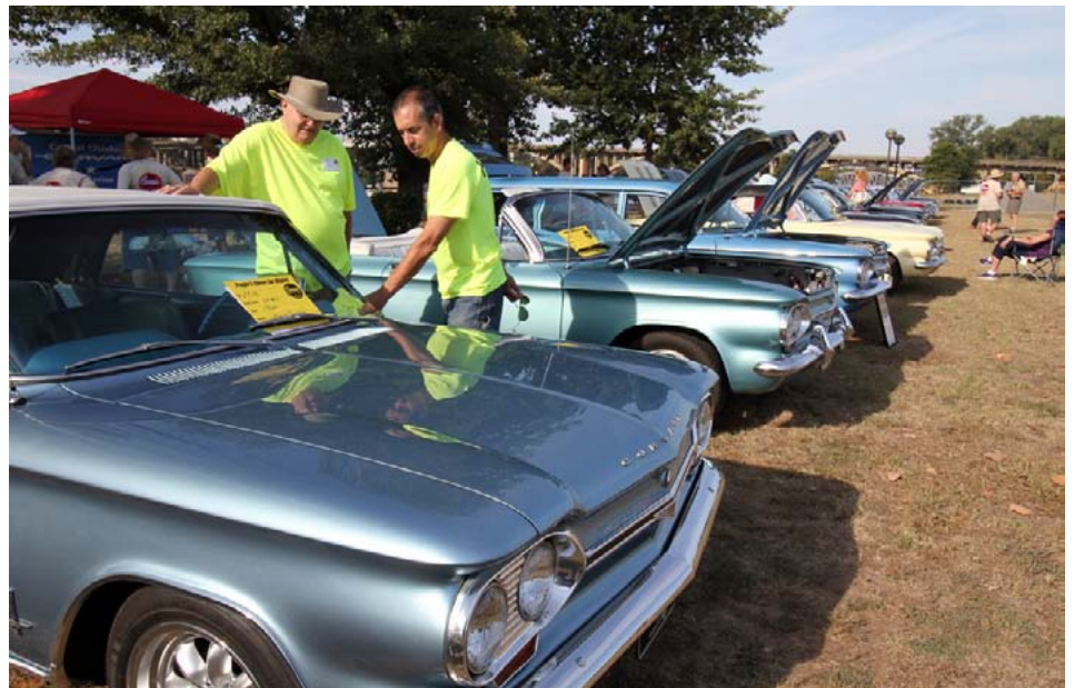
ABOVE: A couple of members of the host Arkansas club check out the row of Early Model Corvairs at the Peoples' Choice Car Show.