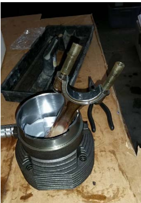
Piston loaded into cylinder

The cold weather and a bout with a nasty head cold slowed Ned down a bit. After all the clearances were checked the fresh and cleaned parts started going back together. Since Ned will be adding air conditioning, extra effort was made to make it run cool.