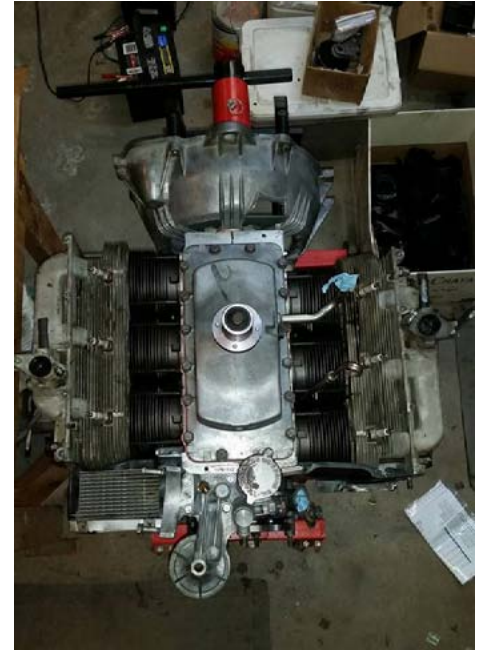
Longblock all together.