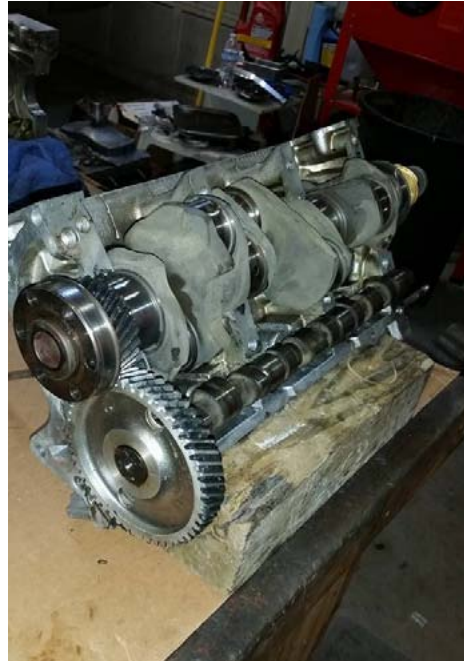
Crank &amp; camshaft installed.