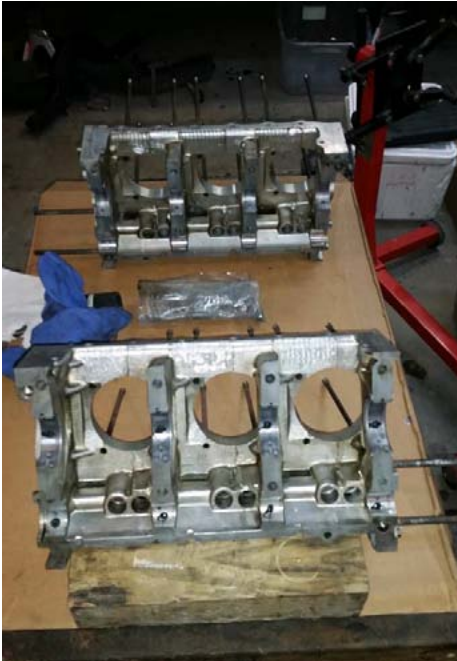
Bare, clean cases ready to start.