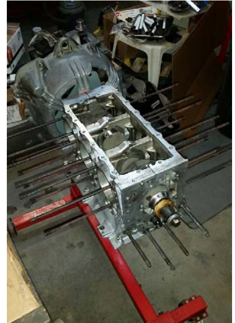
Block, bellhousing assembled.