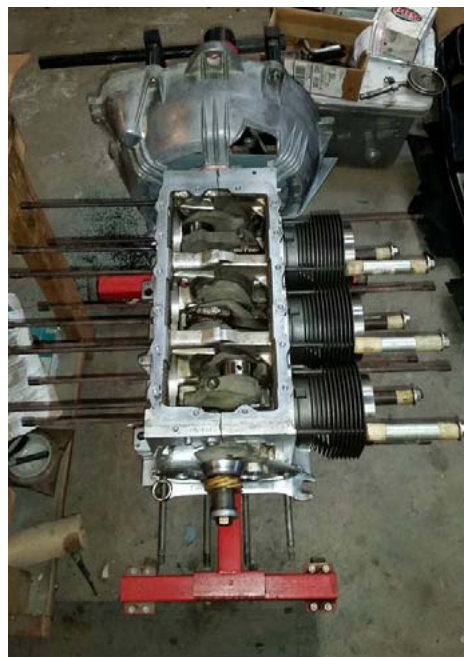
3 cylinders installed 3 to go