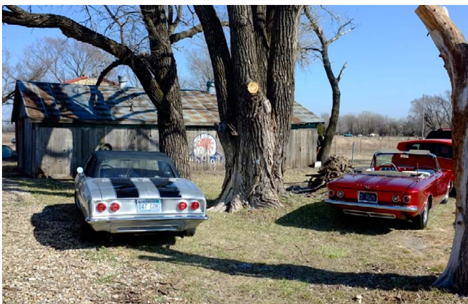
The warm weather brought out the convertibles. LP Penner’s ‘67 factory air 4-speed on the left and Gary Miller’s Candy Apple Red ‘64 Spyder on the right. Both owners painted their own Corvairs. They look great.