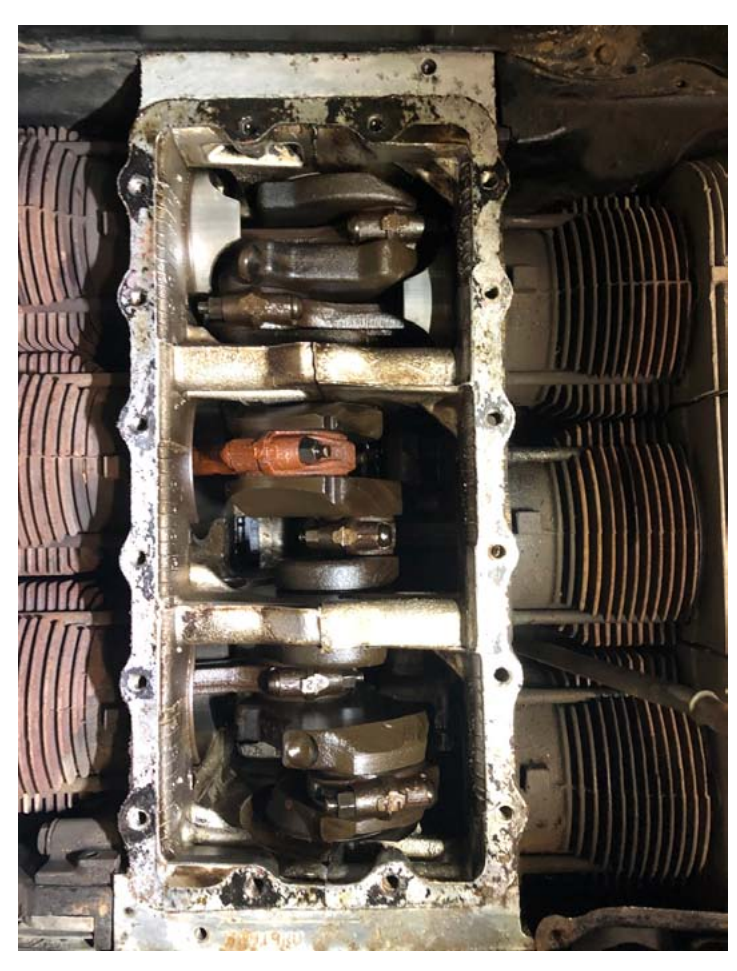
Once to top cover is removed, it is apparent that something is different. The rod with flash copper plating jumps out . . . looks like rust at first.

Six months ago I greased the engine blower bearing on my white '65 Corsa convertible hoping to get a few more years of service. But recently it began howling when cold and needed replacement. Not an easy job because virtually everything on top of the engine had to be removed to gain access to the engine top cover so it could be removed, and the attached blower bearing replaced. The top cover came off uneventfully, but when I removed the baffle plate underneath I had quite a surprise. The No. 4 connecting rod appeared to be covered in slimy rust! But to the touch, nothing