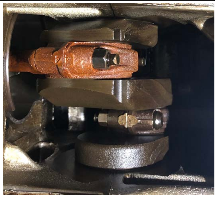
A little closer up shot shows that the rod bolt was left in the rod during the plating process. The plating also created an interesting texture on the rod.

came off and the surface was actually very hard. Puzzling indeed! What was going on?