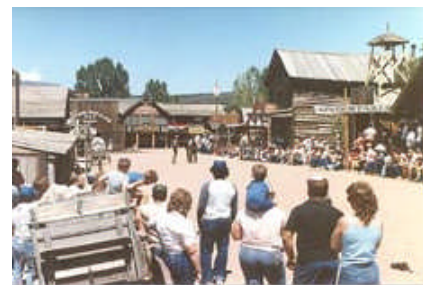
Visit Buckskin Joe's Frontier Town

Main St. Will be "Corvair Avenue" Antique Shops Line The Streets