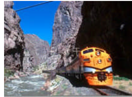
Ride A Train Through Royal Gorge!