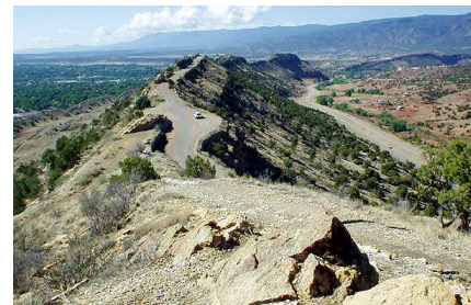
Travel Skyline Drive If You Dare!