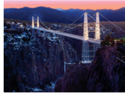
Drive Across the Beautiful Royal Gorge Bridge