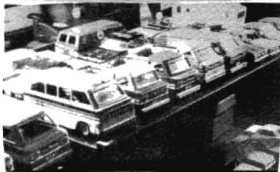
A few KTS 95s: L-R Stock Corvan, School bus MP Rampside (China), KTS Rampside, ABC service Rampside, REA AIR Express, Van in back is KTS Bell System Corvan