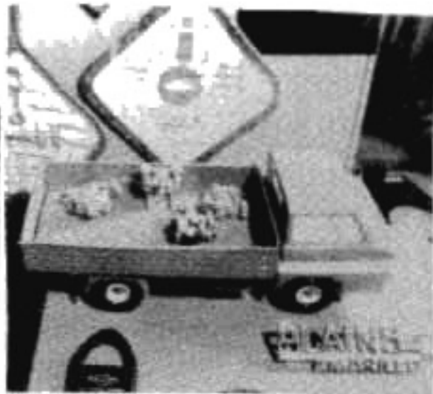
Stalberg (fantasy) Dump Truck with load of engines