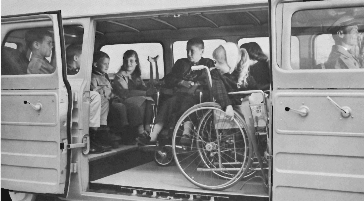
The Corvan's spacious interior offers passengers uncramped breathing space aplenty, with ample room for three wheel-chair passengers and four ambulatory passengers.