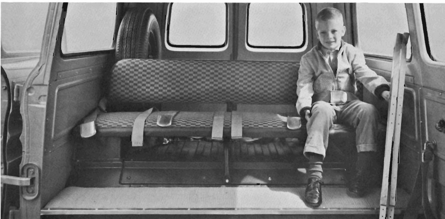
Wide, comfortable rear seat is equipped with individual safety belts. The elevated portion of the floor serves as a natural footrest.