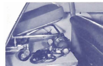
A-501 Portable Oxygen Inhalator mounted near attendant's seat