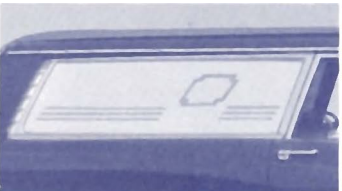
A-411 Ambulance Inserts which are quickly removed providing original window transparency.