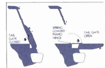
A-634 Cover Plate for Tailgate Aperture, operates automatically—no gaps for cot wheels to drop into.