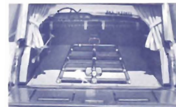
A-601 Casket rack with adjustable bier pins and A-603 Casket Rollers mounted in tailgate.