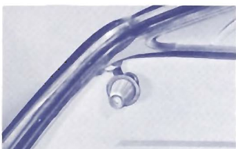
A-308 Loading Lights to aid in night work.