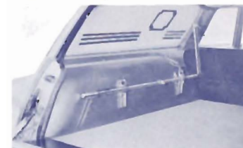
A-6023 Cot Holder with swing back feature which allows second seat to be used without removing cot holder.