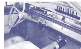
A-511 Fire Extinguisher (required for interstate travel) and A-635 "Ambulance" Cowl Plates.