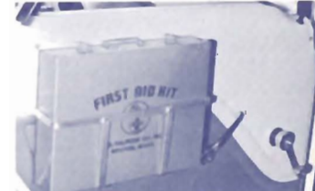
A-522 First Aid Kit and mounting frame designed for quick and easy removal of kit.