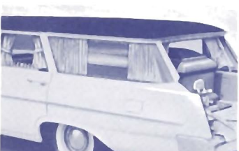
A-401, 402, and 403 Drapes are mounted on removable chrome frames.