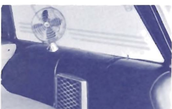
A-325 Ventilating Fan A-324 Auxiliary Heater