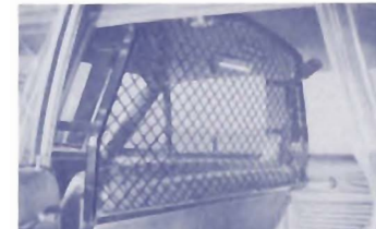
A-695 Protector, Metal Screen, mounted above & behind front seat.