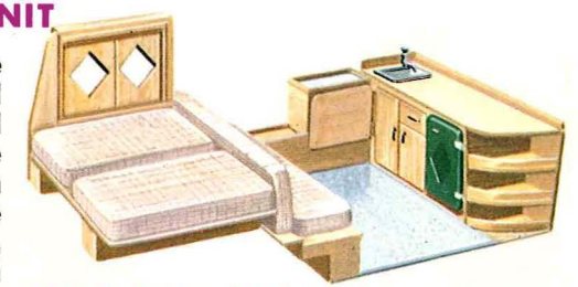
PART NO. 985654

Complete with double bed, drapes, sink and ice refrigerator. Installed or removed from the vehicle quickly. With the addition of a stove and cooking utensils, a complete home on wheels.