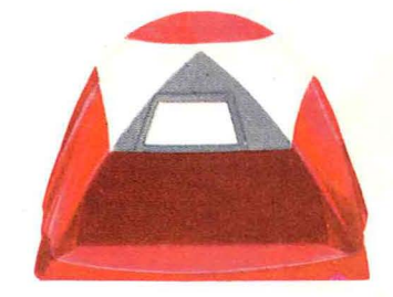
PART NO. 985101

Sail boat 7.68 ounce drill cloth with fiberglas ribs and sewn in floor. Tent is 8 by 10 foot and 6 foot 4 inches high, complete with window and mosquito netting. Folds to neat package for traveling.