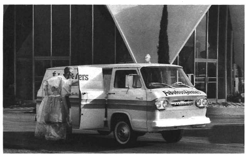
Handsome Chevrolet Corvan builds prestige for any business, but its good looks are only half the story. It will carry 1,700 lbs. of payload in its roomy 191-cu-ft cargo space, and it's built to outlast any other delivery truck in its class. It's your first choice for stamina and economy.

On they rolled, around the clock, interrupted every 17th trip for routine maintenance. And all trucks performed flawlessly throughout the run! They displayed the quality of Corvair 95 design, the new working strength provided by new engine and chassis components . . . showed the kind of staying power that means lower costs on any job.