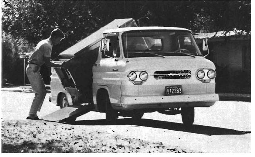
Unique Chevrolet Rampside Pickup has the smartest new loading idea in years. Rugged swing-down loading ramp lets you roll or skid heavy or bulky cargo into the spacious pickup box. It will take 1,850 lbs.—close to a ton—of payload and still handle with ease on all types of roads.

See what gives new Corvair 95 toughness and value ▶