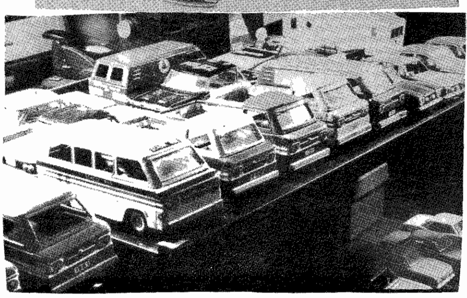
A few KTS 95s: L-R Stock Corvan, School bus MF Rampside (China). KTS Rampside. ABC service Rampside, REA AIR Express, Van in back is KTS Bell System Corvan