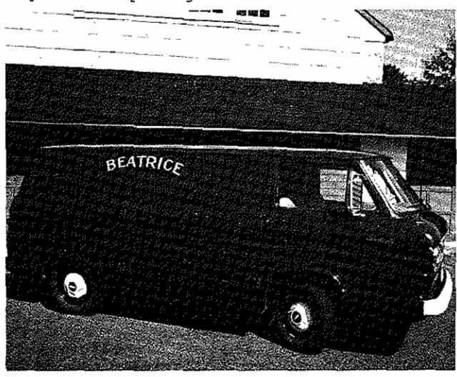
BILL GARRISON'S FIRE ENGINE RED, 20,000 MILE, "LOWEST BIDDER" 1964 CORVAN

Now the not-so-good news. This is a lowest bidder truck. No inside rear view mirror, no passenger side sunvisor, no radio, no chrome bumpers, etc. Don't even think of looking for an armrest. I learned something when I picked up the truck. You should buy a vehicle from a volunteer fire department. Beatrice has a paid company so everything is from the lowest bidder. Volunteer companies will traditionally hold an extra car wash to get chrome bumpers and a passenger side sunvisor.