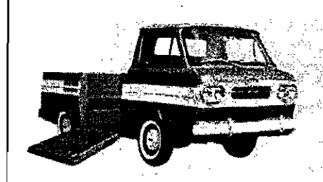
Pickups Rampside - Loadside