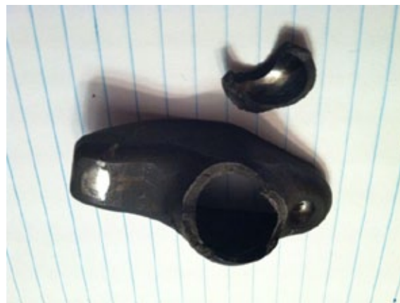
What's left of the failed rocker – pieces are still missing...