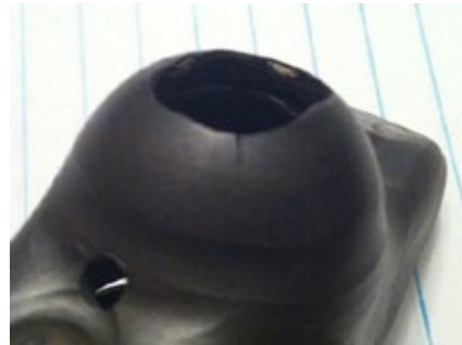
Photo of spare rocker arm, showing crack at 6 o'clock position of the rocker stud hole

These used parts I have are old – originals – and have many miles on them, and unknown history. The lesson I learned here is not that I always need to use new (budget restricts that), but to pay close attention to components, and wear areas.