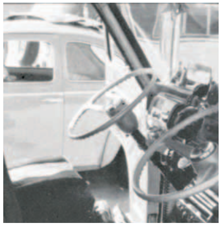
**Nico and the Flying Dutchman were featured in the CORSA Quarterly Volume 5 issue 1, available on the CORSA website in the publications archives.

Making a trip schedule before taking off, and sticking to it, is important if you want to make all the stops you planned and still get back on time. We also allow a couple of days to cover repair of any major items becoming unglued. Last but not least, a trip log is useful, especially if you want to write up your adventures and tell others about them in CORVAN ANTICS.