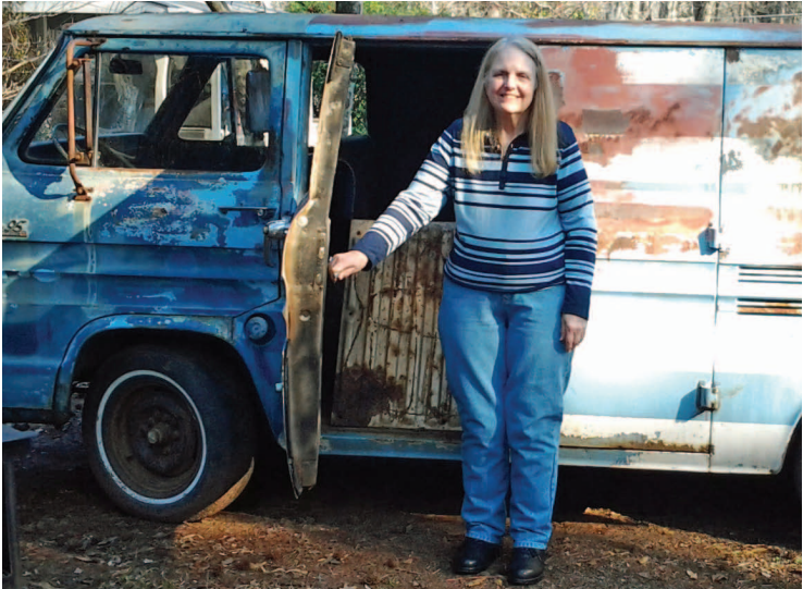
Coming due in the next two months (early reminder) Due May and June