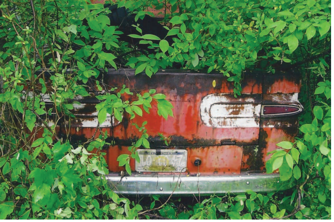
It's a jungle out there, the Rampside was just visible through the brush after 35 years of growth.

My old Rampside is not in the best of condition right now but I'll play around with it and maybe get it back on the road someday as a driver to run around in. You don't always get to buy back an old vehicle that you wish that you had never sold. It feels good just to have it back.