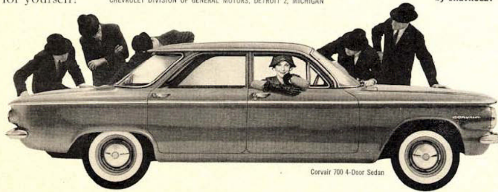
Corvair 700 4-Door Sedan

for economical transportation ★ corvair by CHEVROLET