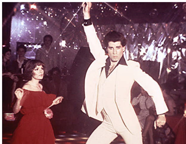
The 1970s. Can you imagine a Corvair with opera windows and a Rolls Royce grill?

Corvair people often bemoan the fact that General Motors axed the Corvair in 1969, but I'm glad they did. Can you imagine a Corvair with opera windows and a fake Rolls Royce grill?