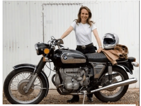
U.S. Rep. Gabrielle Giffords with her vintage BMW motorcycle. Read about her interest in Corvairs in this issue of The Fifth Wheel .