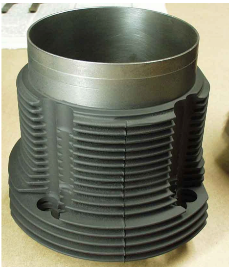
94 millimeter CIMA Mahle jug, machined to clear Corvair cylinder head studs.

Of course, there aren't many old Volkswagen 412s around anymore to serve as donors for such a project, but this engine was also used in the Porsche 914, and so high-performance replacement parts are available. Cima, the Brazilian division of Mahle of Germany, makes aftermarket jugs and pistons for the 412/914 engine, and so that's the secret.