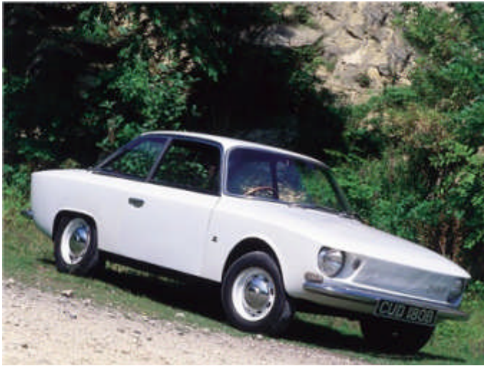
A Hillman Imp coupe, with body by Zagato.