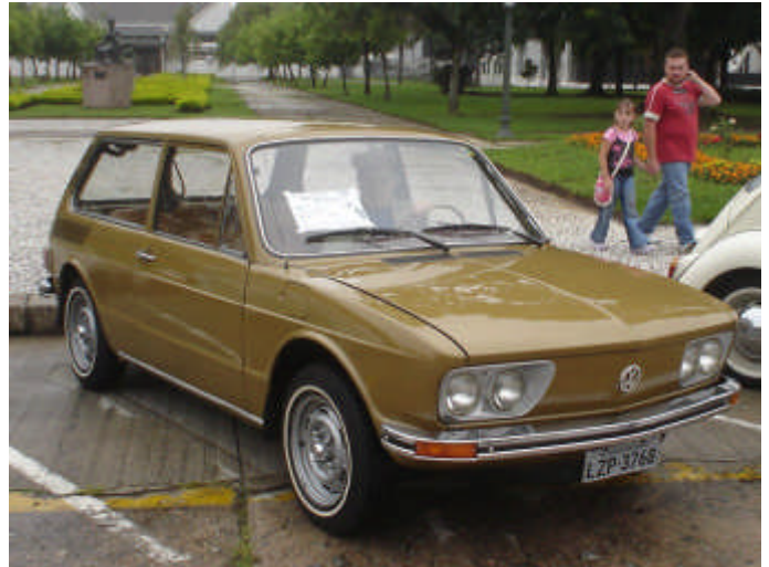
Volkswagen Brasilia. Popular Brazilian version of the Beetle.