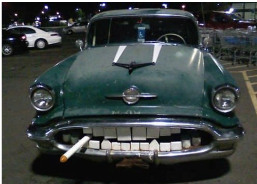
Goodbye to Grills! This '55 Olds appears to be having a smoke!