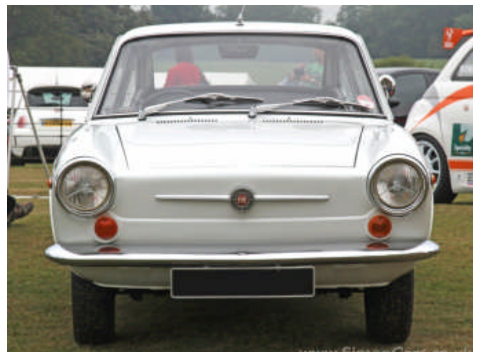
Fiat 850 Sport Coupe.