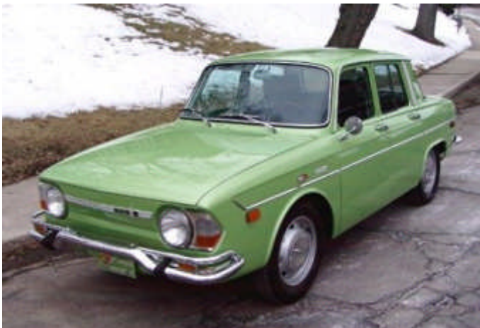
Renault 10. Known for its comfy seats!