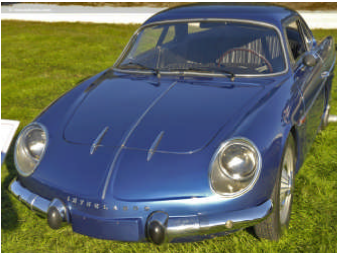
A Willys Interlagos, a Renault Alpine made in Brazil.