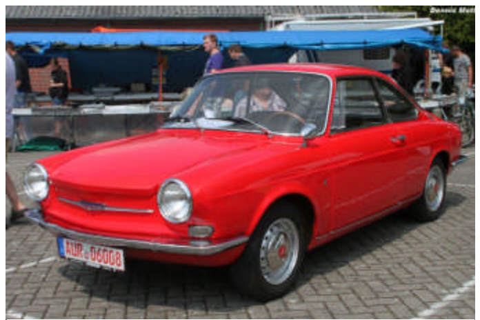
Simca 1000 Coupe, with body by Bertone.