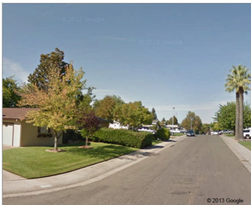
Beautiful Corvair Street, North Highlands, California.