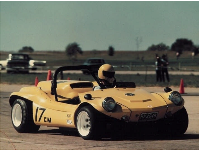
Desertor GS, doing what it was designed to do. Autocrossing.