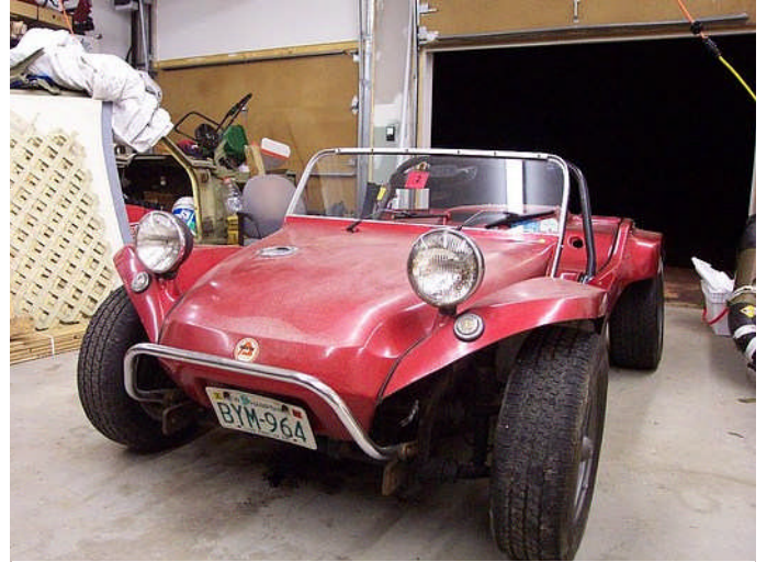
Earlier Desertor GS is easily distinguished by its free-standing headlights.