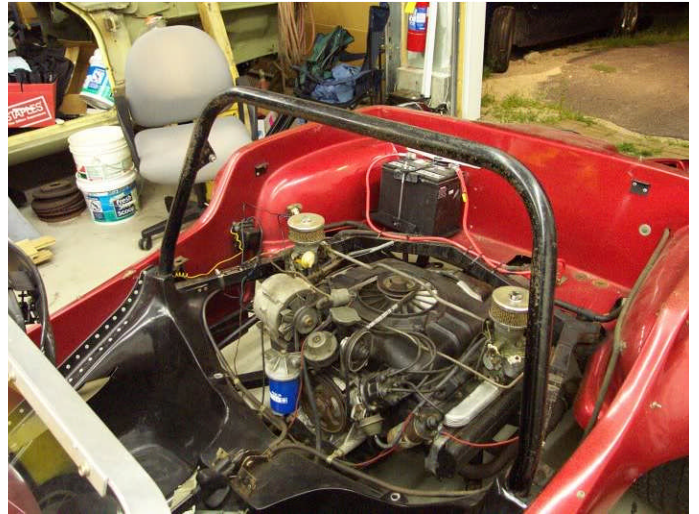
Power by Corvair! Mid-engine location is evident in this photograph.