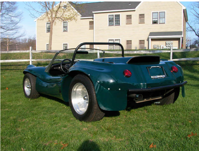
Potent tail of the Desertor GS. Tires are enclosed by fiberglass pods for street.