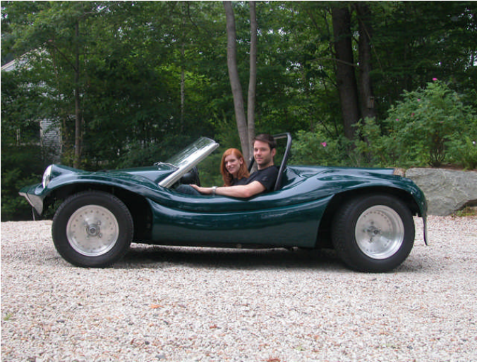
Nicely restored Desertor GS, by Dearborn Automobile Company.