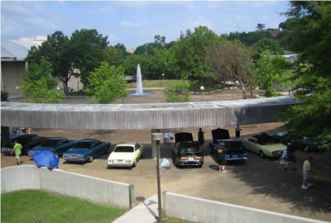
Corvairs at the Concours d' Elegance.