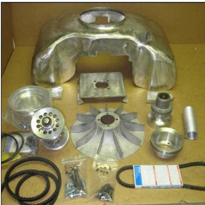
Here is the Tangerine Racing Products kit for four-cylinder Porsche 914s.