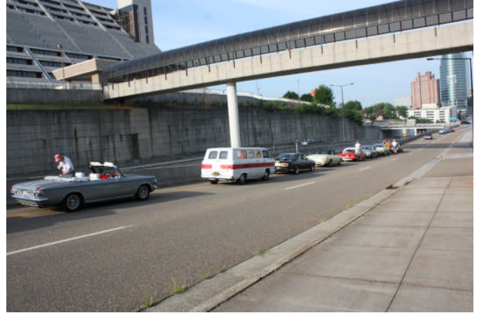
Lining up for the Economy Run across from the hotel.