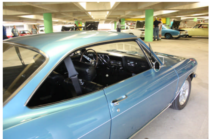
Al Lacki's Corvair getting some rest at the Car Display.