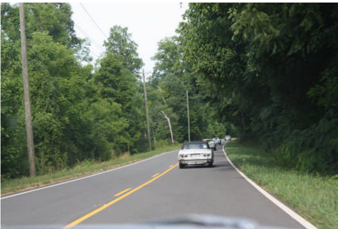
Going up into the Great Smoky Mountains.