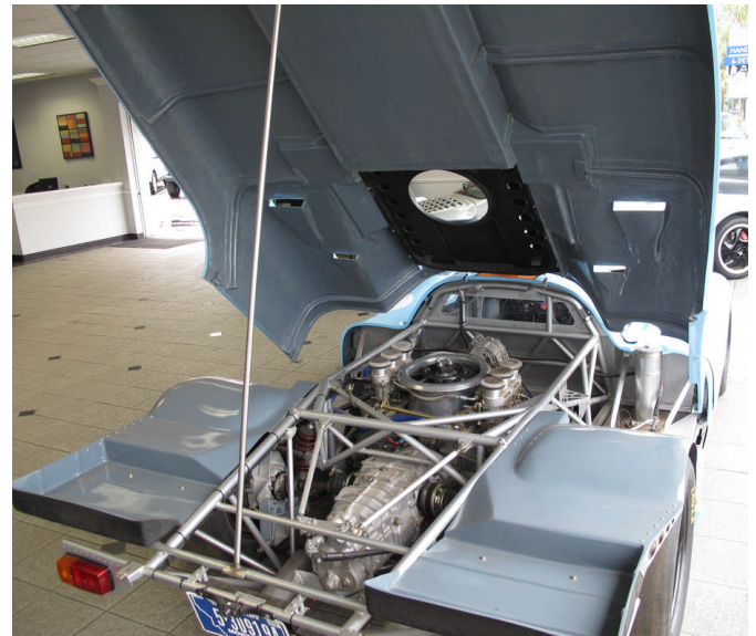
Your Porsche 917 replica needs a horizontal fan!