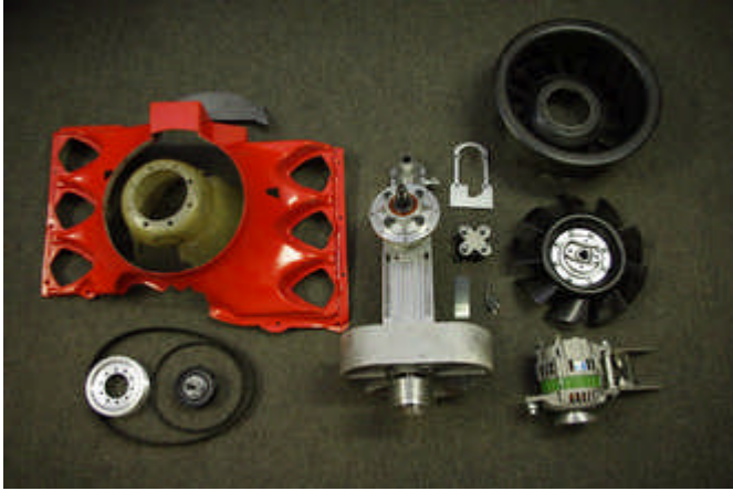
Porsche 911 horizontal cooling fan kit by Bailey.