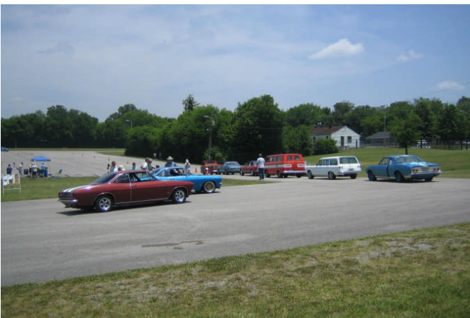
Corvairs lined up or the Autocross.