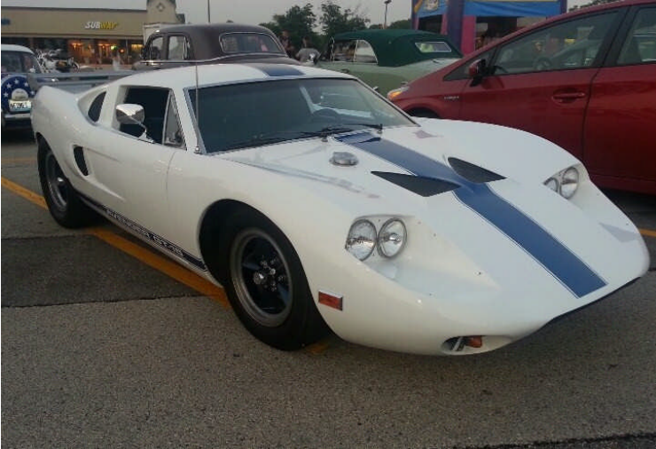
An unmolested Fiberfab Avenger GT-15. The blue and white paint scheme is reminiscent of the original Ford GT-40s.