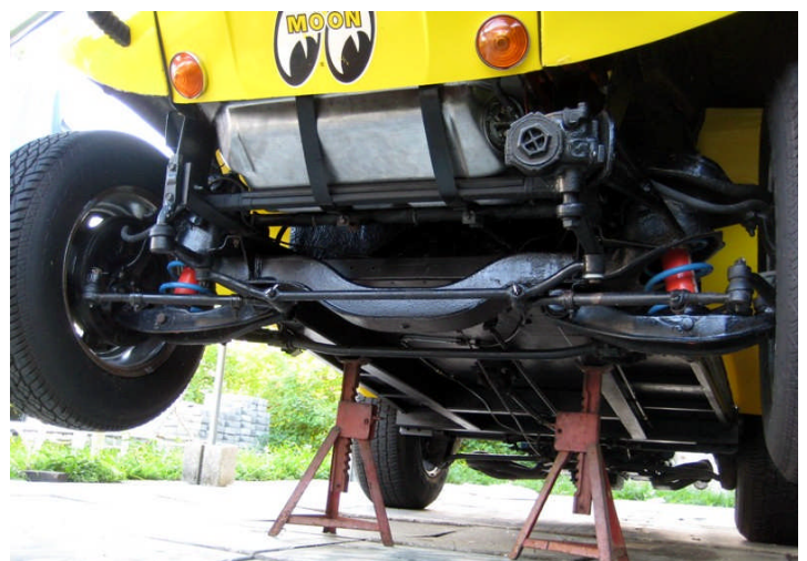
Left: All-Corvair dune buggy frame sold by J.C. Whitney. Right: Here it is installed under a buggy body!