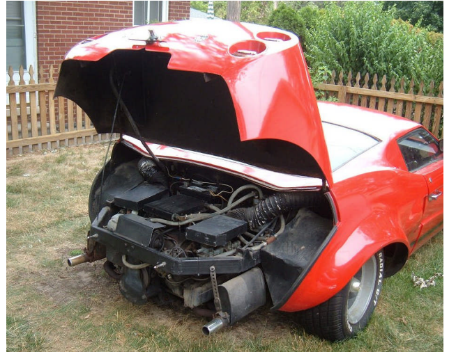
This Avenger GT-15 has a very busy engine compartment!

Photos of Fiberfab Avenger GT-15 frames are hard to come by. This grainy one is from Fiberfab's original sales brochure. If you look closely, you'll see the late-series Corvair rear suspension and front cross-member.