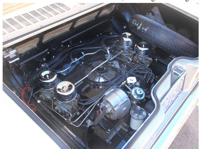
Showing of Corvairs at Vargo Dragway.