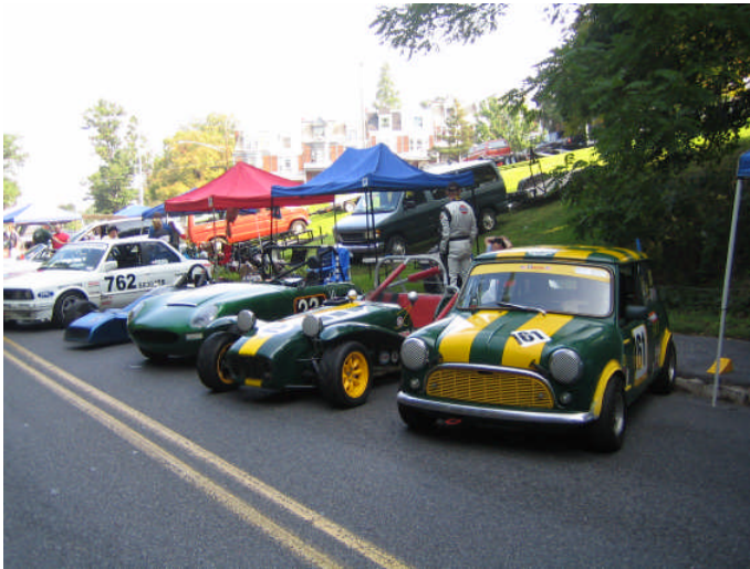
Nearly 100 cars of all types, makes and models.

Some scenes from the Duryea Hill Climb in Reading, Pennsylvania. This has been an annual event since 1951.