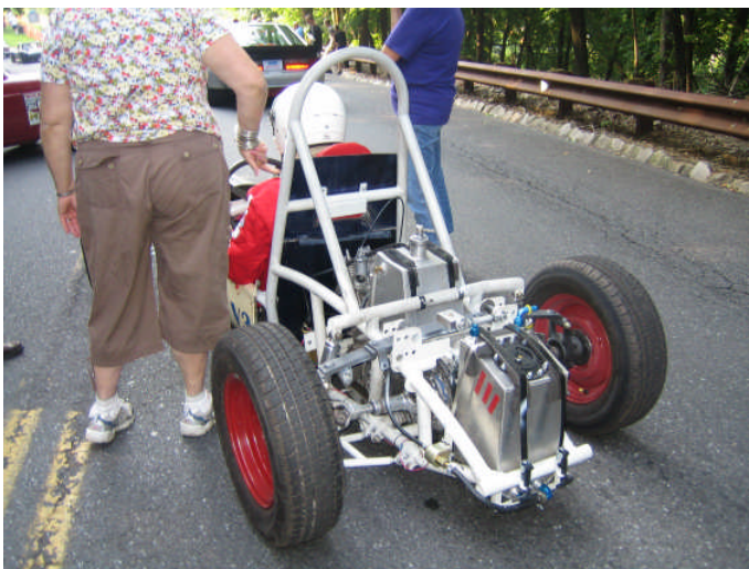
A tiny 1950s Formula Junior car.