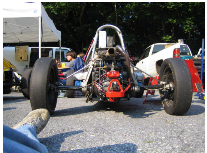
VW-powered Formula V with swing axle suspension.