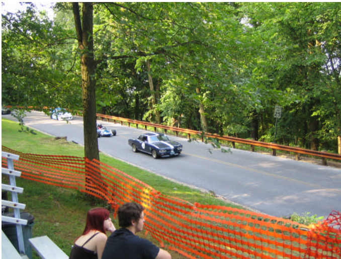
Spectators watch as cars come back down the hill.