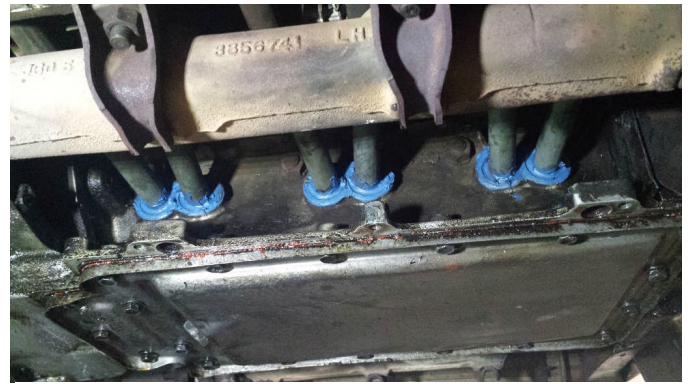
Ewww! RTV is not the proper way to seal-up leaky push rod tubes!