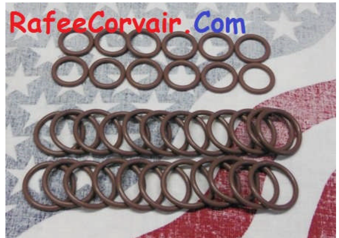
Viton O-rings are typically brown, but not necessarily. Sold by most Corvair parts vendors.