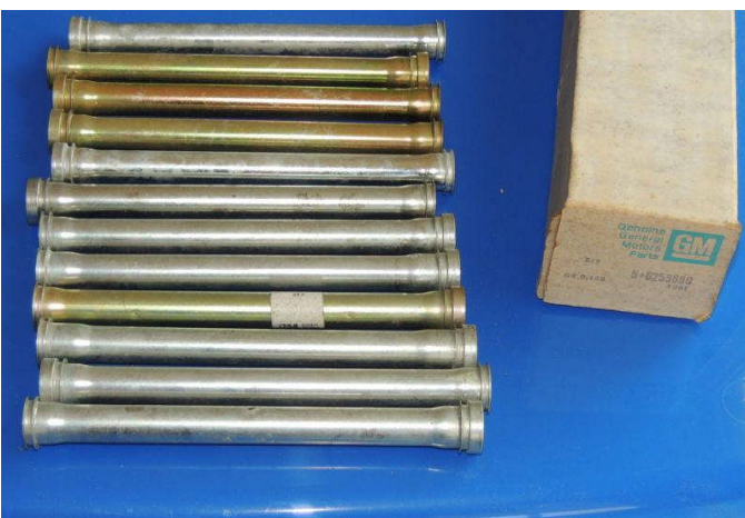
A full set of NOS Corvair push rod tubes. The O-rings snap into the grooves on both ends.