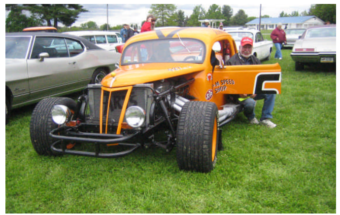
It looks like a vintage dirt track car, but it's actually street-legal with lights, horn, wipers, etc.