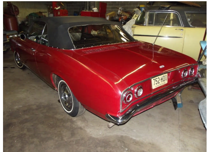
This 140 hp Powerglide Corvair will be one of the items up for auction at the Houser's auction.