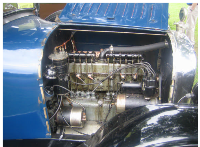
Oldies. We don't need no stinkin' push rod tubes!