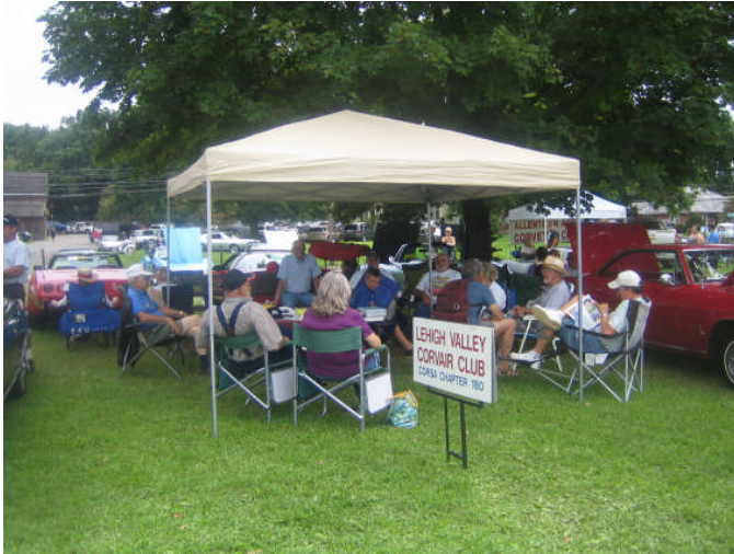
The LVCC gang!