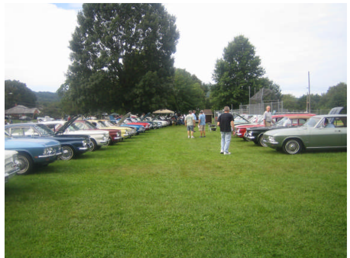
We eventually filled 3 rows of Corvairs!