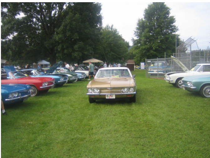
They kept coming in!