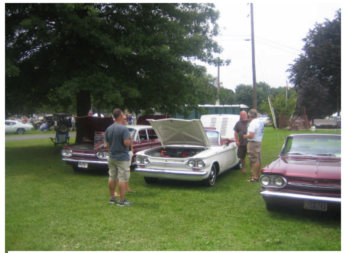
Lineup of earlyies.