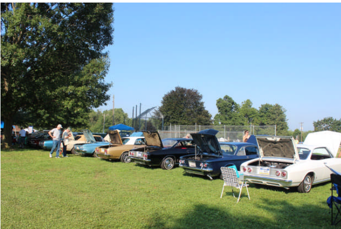
Corvair engine lids, open for public inspection!