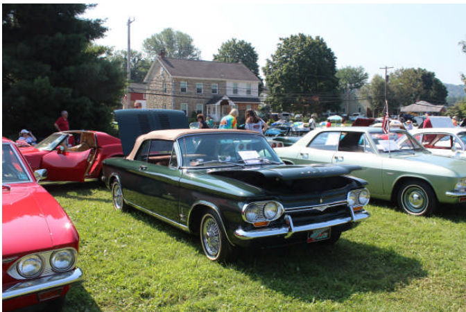
One of two 1964 Spyder convertibles.