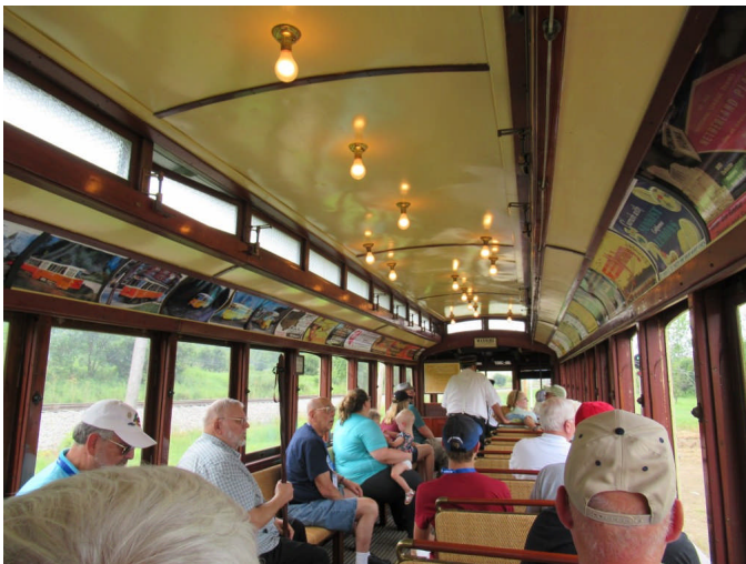
Side trips included a stop at the trolley museum.