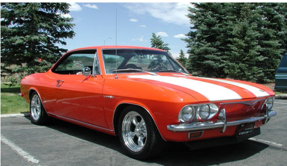
Author Ray Coker's Corsa, "Fast Orange".

If the mufflers on your Corvair don't allow you to use the radio... it's too loud. If the mufflers on your Corvair don't allow you to use a cell phone... it's too loud. If the mufflers on your Corvair don't allow you to talk to your passenger without leaning over... it's too loud. If the mufflers on your Corvair make all the neighbors' dogs bark, drown out emergency vehicle sirens, make you not notice jets doing low flyovers near you or drown out guns being fired at you for waking the baby... it's too damn loud.