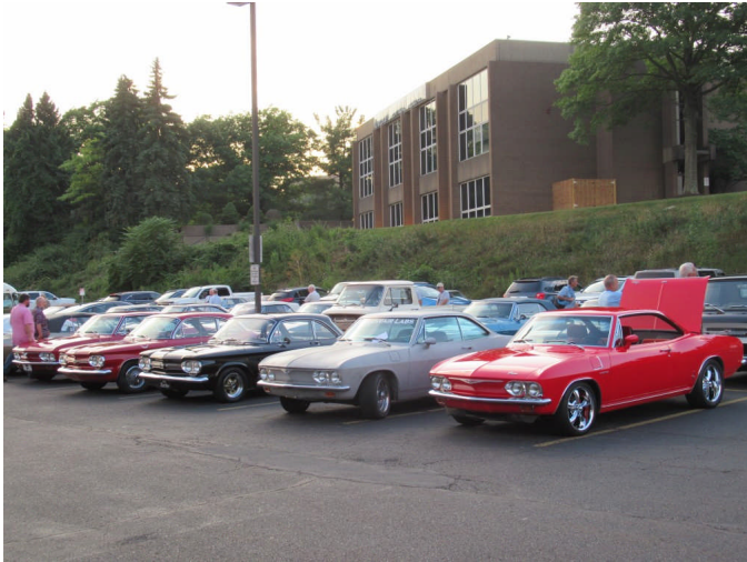
A small portion of the Corvairs at the host hotel.