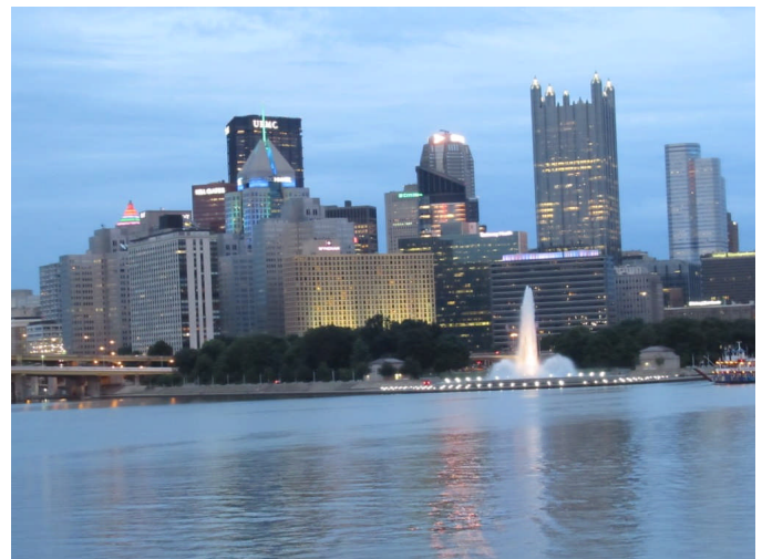
Dinner Cruise. Pittsburgh skyline at dusk.