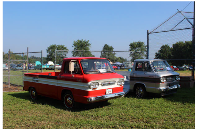
Two of the three Rampides on display this year.