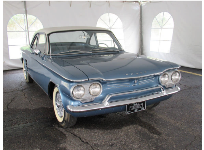
1960 Corvair Super Monza from the CPF.