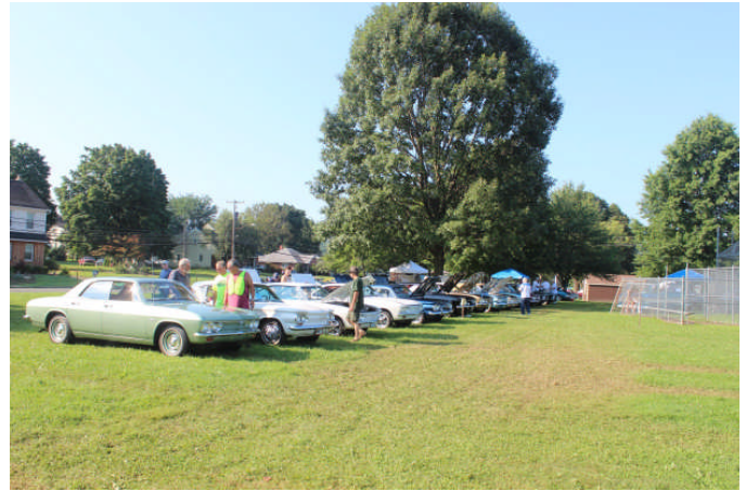
Early morning photo before the field was filled.