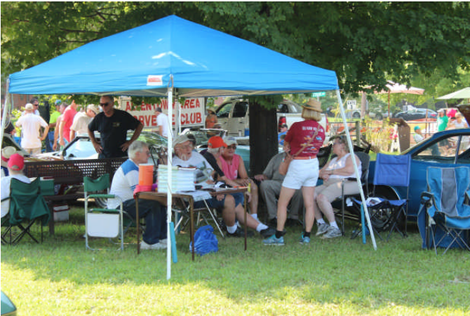
The LVCC tent provided all-day shade.