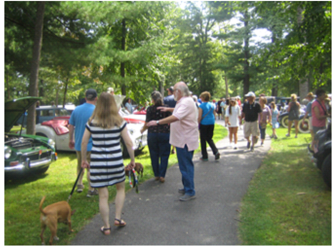
Duryea Day draws lots of spectators.