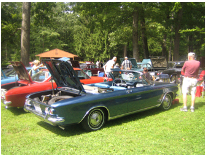
A nice '64 Monza convertible.