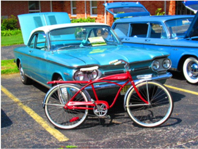
Blue '62 Monza flanked by a Corvair bicycle.