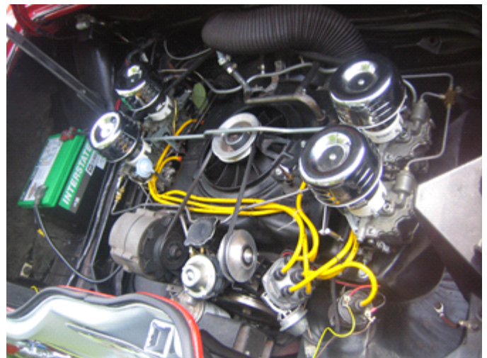
140 hp / 4-carb Corvair engine.