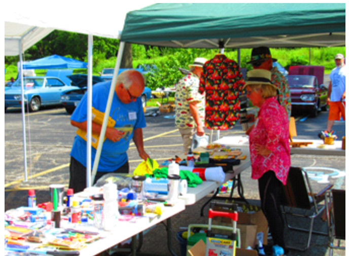
Your editor even wore his blue Corvair T-shirt!