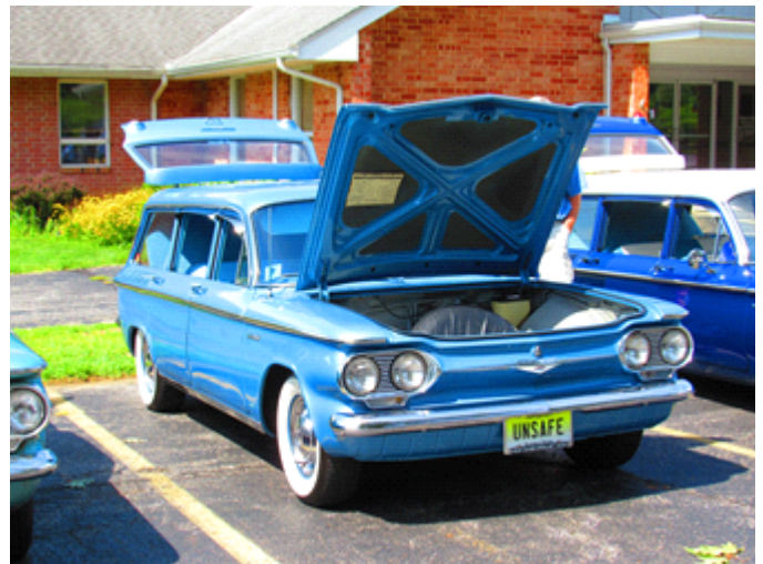
1961 blue Lakewood wagon.