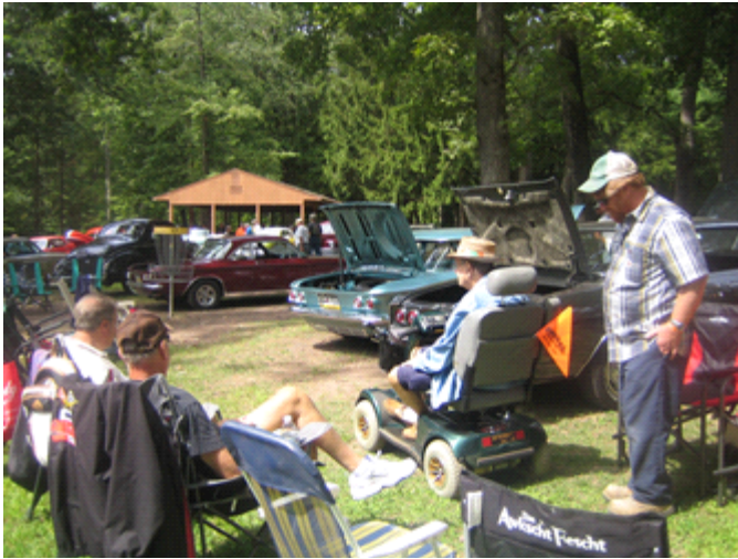
PCA guys grabbed shady spot for the Corvairs.