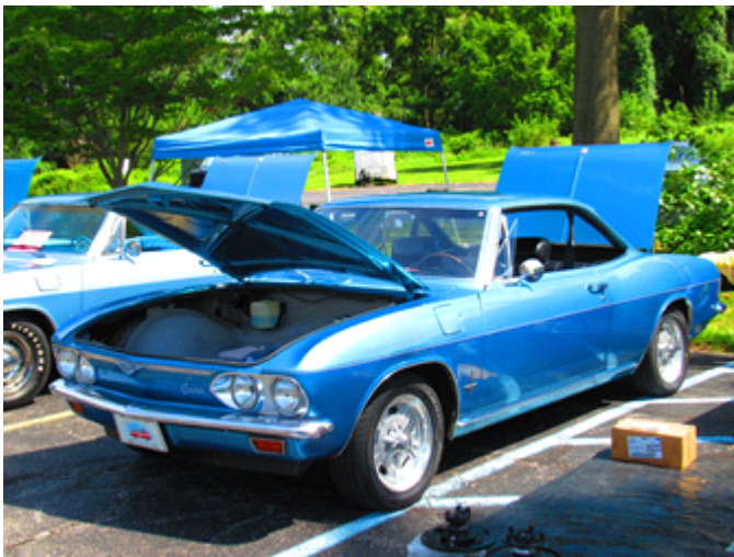
LVCC Editor Al Lacki's blue Monza.