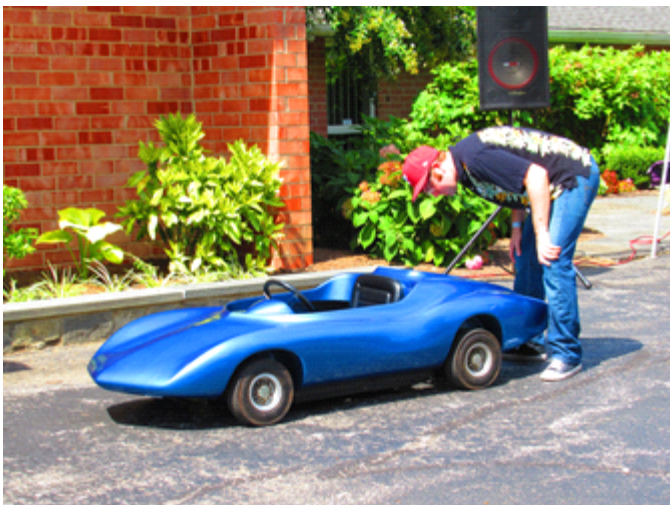
Blue Chevy Junior.